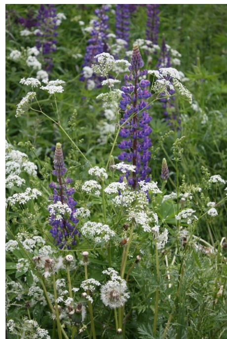
FIGURE 1 A mixed population of Anthriscus sylvestris and the invader Lupinus polyphyllus .

Seedlings of cow parsleys, A. sylvestris , were collected from three sites invaded (hereafter experienced) by a garden lupine, L. polyphyllus (Figure 1), and from three uninvaded sites (hereafter naïve) in Central Finland (Jyväskylä, 62°N, 25°E). Anthriscus sylvestris was planted together with L. polyphyllus in 3 L pots (diameter: 16 cm, tall: 12 cm) filled with a 2.5 L of 1:1 mixture of potting soil (Kekkilä Oy, viljelyseos) and sand. Both A. sylvestris and L. polyphyllus were also planted alone. Plants grown alone and in pairs were assigned into the three soil treatments: control, activated carbon, and fertilizer treatment (Table 1). Activated carbon (20 ml/L of soil, Merck KGaA) was mixed with the substrate to ameliorate the allelopathic effects of L. polyphyllus . As a control for the activated carbon treatment, we added fertilizer (0.4 g per pot, Kekkilä, puutarhalannoite, NPK 9-4-13) to another set of pots. This allowed us to distinguish the absorption of allelochemicals and fertilizing effects of activated carbon