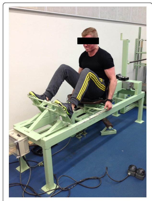
Fig. 2 Maximal isometric bilateral leg extension

measurement was recorded by an isometric strain-gauge dynamometer. A minimum of two trials were performed for each subject and the best result was selected for further analysis. This method is well documented and used in many previous studies [26, 27]. The reproducibility of measurements of maximal isometric muscle force is high (r=0.98,\ \text{C.V.}=4.1\%) [28]. Finally, overall maximal muscle strength in the present study refers to the results of these three measurements (leg extension and trunk flexion and extension).