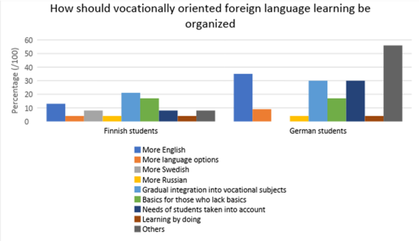
Table 2: Suggested changes for vocationally oriented foreign language teaching. All interviewed students did not handle this topic: N=24 Finnish students, N=23 German students. The table was drawn after the theme interviews and is based on students’ responses to the topic.

The German students often mentioned their employer during the apprenticeship as a possible foreign language instructor. This might again result from the difference in VET systems: since the students can later be employed by their apprenticeship company, they probably value tailor-made language training for the specific needs of the company. The heterogeneous competence levels in foreign language skills due to heterogeneous school backgrounds was often seen as an obstacle for successful foreign language instruction.