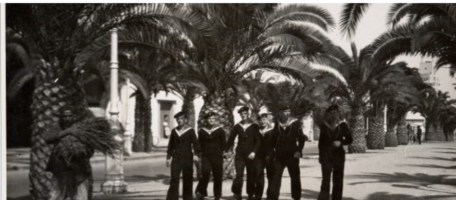
Finnish seamen from Suomen Joutsen, a school ship for Finnish Navy, in Lissabon 21.-22.4.1934.