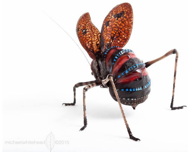
Figure 1. Photograph of an adult female mountain katydid performing her display.

of their display could decrease as a function of predator experience, if predators learn to suppress their aversive response 27 . Alternatively, this effect may be ameliorated by the presence of further co-occurring defences, such as an aposematic element combined with a deimatic element.