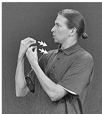
Fig. 2. FinSL Type 2 verbal TEACH as used in the elliptical clause (7). Note that the signer also employs constructed action to show the imaginary locations of the referents. Image from Suomalaisen viittomakielen perussanakirja (1998).