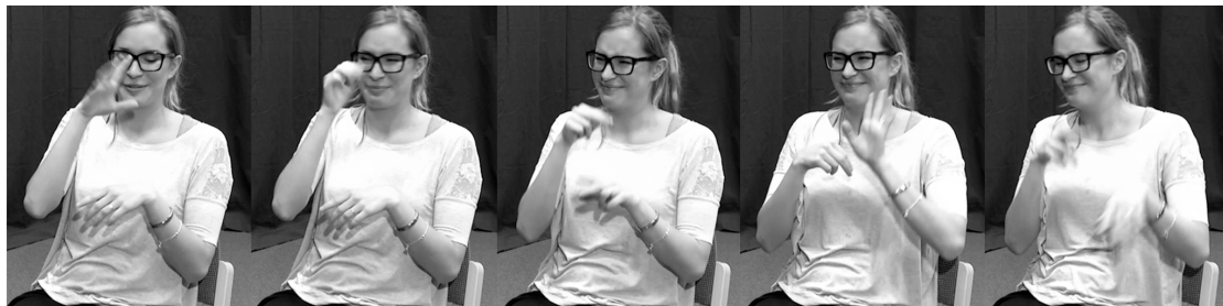
Fig. 3. Video frames showing the production of the sentence (17).

(17) In telling a story about a boy, dog, and a frog: