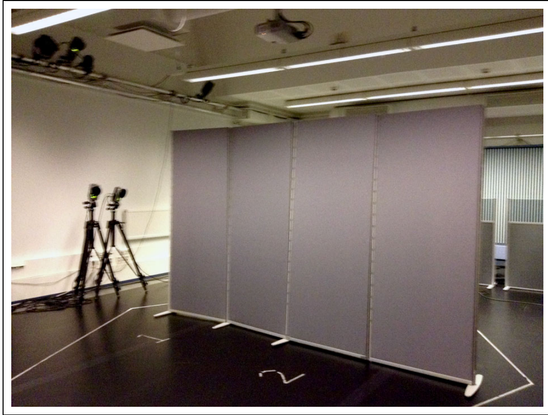
Figure 2. Motion capture space and divider wall.

(Luck & Toiviainen, 2006), and has previously been used to give broad information about overall amount of movement within whole performances (Carlson et al., 2016). This approach allows for wide variety to exist between dancers' free, improvised movements, as individuals may choose to embody the music in many different ways while still responding to and interacting with each other. Using overall acceleration also mitigates potential differences in dancers' movements related to culture, while still providing broad information on essential aspects of their movements. Acceleration in three dimensions of the joints was calculated using numerical differentiation and a Butterworth smoothing filter (second order zero-phase digital filter). For each participant, the instantaneous magnitudes of acceleration were estimated for each joint and stimulus, and subsequently temporally averaged over each stimulus.