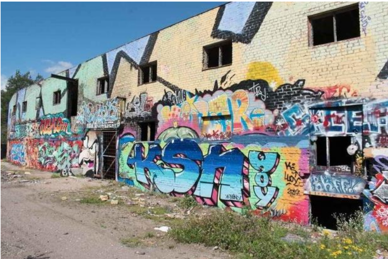
Image 1. Several graffiti pieces on the southern façade of the roofing felt factory in Santalahti. Kai Ylinen 2017.

Santalahti is located two kilometers to the west from the city center, between a railroad and the lake Näsijärvi. In particular the eastern part of the Santalahti area comprises of historical factories, which made goods such as paper and matches in their time, as well as of warehouses and buildings associated with the industrial activity. The two former industrial blocks that are currently framed by the match factory, the paper factory, the bone meal factory, and the roofing felt factory are in unauthorized temporary use by urban subcultures, such as graffiti artists, skateboarders, photographers, and the young. The graffiti storyline in the two factory blocks in Santalahti began uninvited in 1990s after all formal activity in the factory buildings had ceased. Over the two following decades the writers and artists gradually painted layers of graffiti pieces inside and out on all four factory buildings and their warehouses. The long wall on the other side of the railroad is also painted with graffiti and considered a hall of fame within the scene.