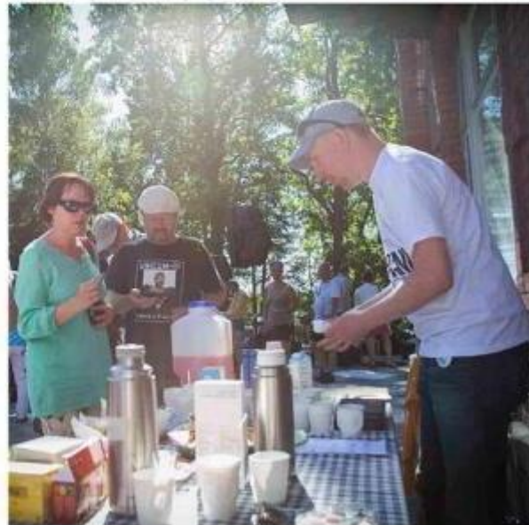
The Restaurant Day food carnival arranged by Urbaani Tampere was a success.