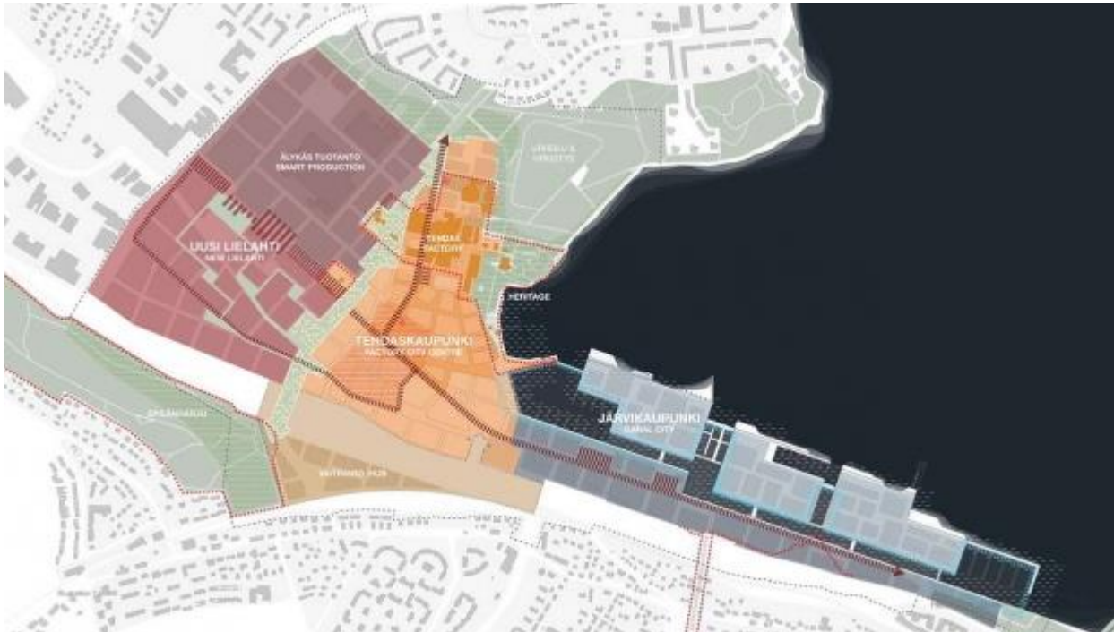
Image 4. A map of the future Hiedanranta showcasing the three neighborhood identities, courtesy of the City of Tampere, visible on the page 19 in the Structure Plan of Hiedanranta.