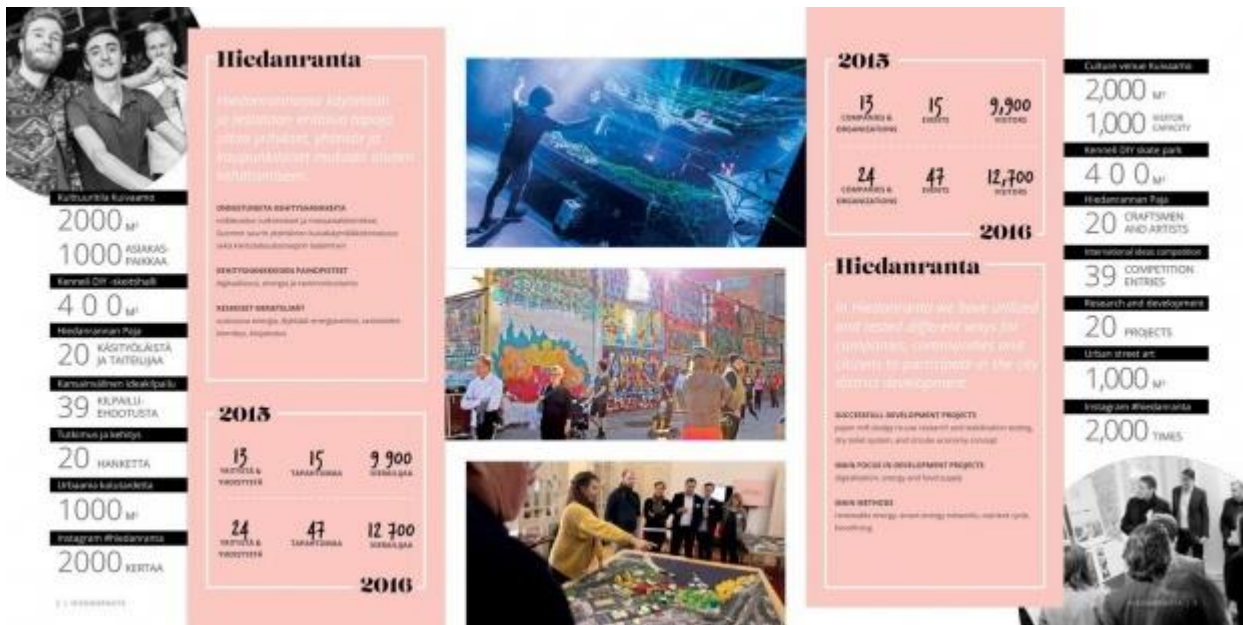
Image 10. A page from the Hiedanranta flyer.

In a short news article (“Hiedanrannassa maalattiin seinää” 2016) about the same Spraycankontrol event held in Hiedanranta, graffiti and street art are depicted as a positive force. Those who have done the graffiti are described as artists, and a city official “rejoices” about the fact that Hiedanranta is now a “significant street art destination nationwide.” The event was organized with the support of the City of Tampere.