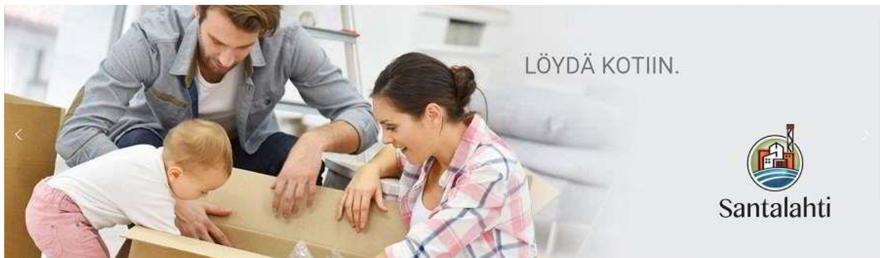
Image 8. “Find Home”. A screenshot of the header banner on the front page of the New Santalahti website.

The New Santalahti website also allows its visitors and possible new residents to participate in a survey concentrating on what the Santalahti of their dreams is like. The website emphasizes that everyone is welcome: “[Santalahti] holds thousands of stories, ambiences, and hopes. Come and make your own stories true.” In Image 8, the future residents are urged to find a home in Santalahti.