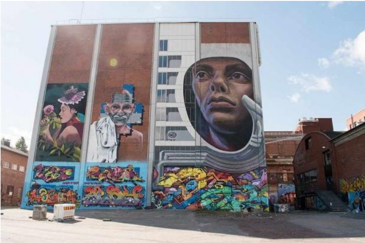
Image 3. A few of the graffiti and mural art pieces made in the event of Spraycankontrol '17 in Hiedanranta. Kai Ylinen 2017.

The planners of Hiedanranta have chosen a participatory planning approach to which storytelling methods have been central. The planning of Hiedanranta is still in process. In the structure plan published in 2017, the future Hiedanranta is divided into three subareas, as shown in Image 4 below: 1) the Lielähti Hybrid District, an innovative part of the Lielähti commercial area, 2) the Factory City, consisting mainly of the post-industrial environment and the historical Lielähti Mansion area, and 3) the Canal City, a neighborhood in the shore zone of lake Näsijärvi, between the central marina and Santalahti marina. The district is anticipated to offer homes for 25 000 residents and new jobs for 10 000. Like in Santalahti, the future tramline will be operating in Hiedanranta.