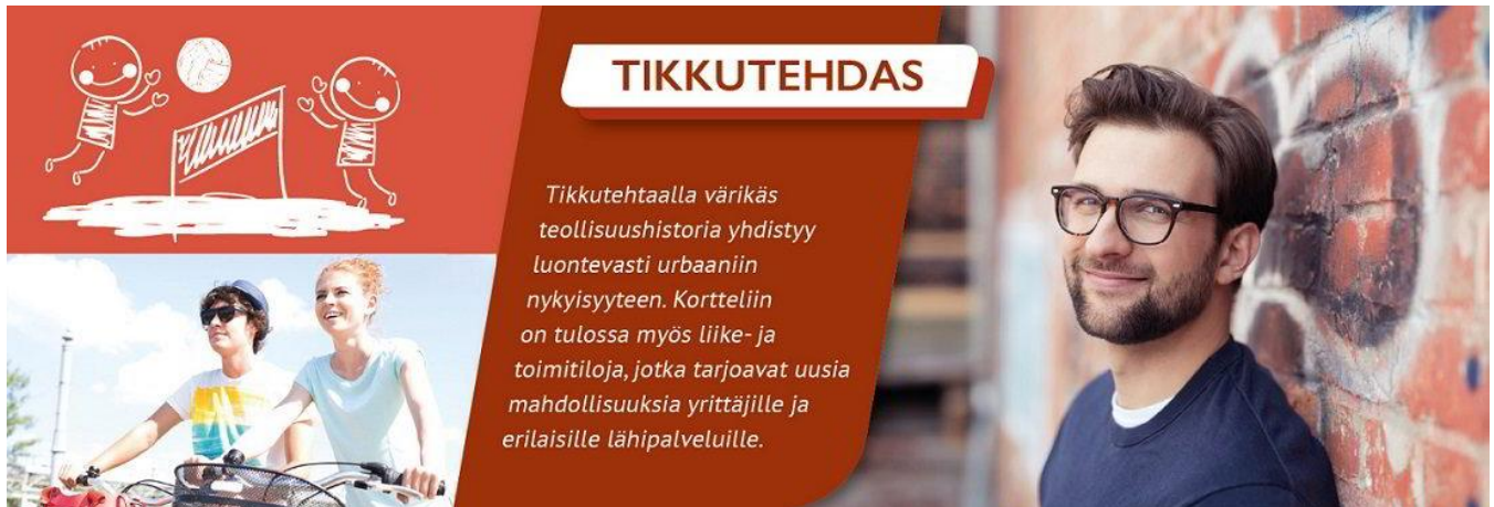
Image 5. A section concerning the match factory area from the New Santalahti flyer. The chosen photograph also shows pieces of graffiti as an effect of mixing history with recent urbanity.

In Hiedanranta, historical elements are also considered an essential part of the identity of the future district. In these visions, the old factory buildings are upgraded and renewed. The old industrial buildings are given a new purpose as “restaurants, exercise centers, and culture hubs” (Kalliosaari 2016). The designs, such as those shown in Image 6, show the historical factory buildings as “the heart of the city centre” and “[t]he development anchor of the area” (City of Tampere 2017c).