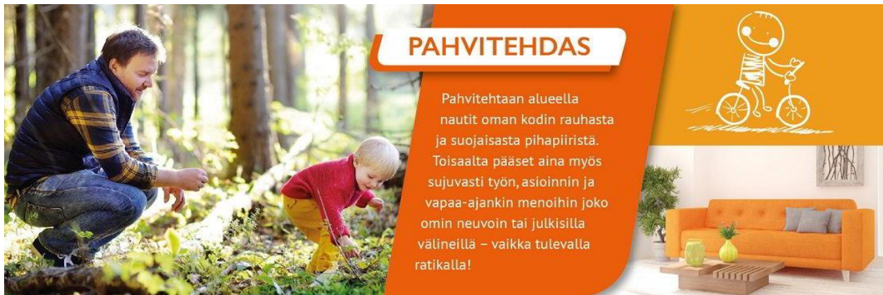
Image 7. A section concerning the area of the cardboard factory from the New Santalahti flyer. Nature, the family life, and different activities are well presented.

Santalahti. On the flyer, as seen in Image 7, the residents can enjoy the peace of their own secluded home in the immediate neighborhood of the cardboard factory but may also conveniently go wherever they like – even by tram.