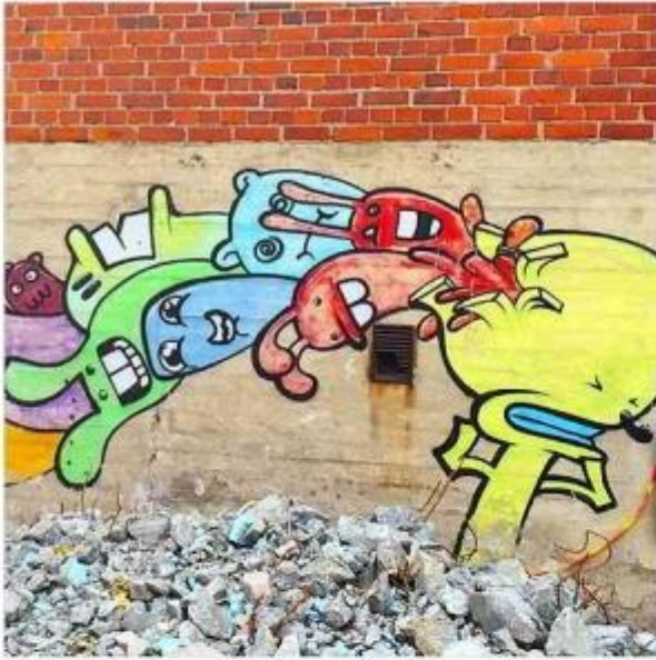
Many have asked for a graffiti wall.

“What is at the heart of city living is that the city is the people’s living room, backyard and kitchen all at once. A city has failed in its mission when the people living in it don’t feel like they can make themselves at home in every nook and cranny.”