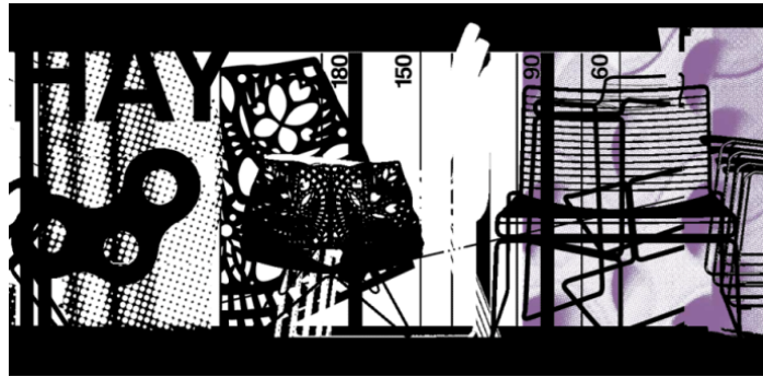
Figure 2. HAY Website, 2000. The early version of www.hay.dk is an example of deconstructive graphic expression, where the surface elements of the website do not create an immediate access to the information about the company. Instead of directly transmitting the content of the website, which is to be found beneath the surface, the dense graphic appearance points to the aesthetic code of communication on the website.