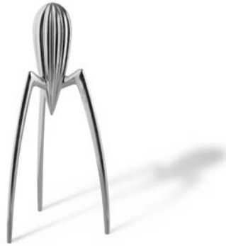
Figure 1. Lemon squeezer Juicy Salif designed by Philippe Starck for Alessi, Italy in 1990. This lemon squeezer is probably one of the most discussed in the literature on material design (cf. Julier, 2014) and is on the cover of Don Norman’s book Emotional Design (2004). The lemon squeezer provokes by being on the verge of nonfunction; it invites reflection, interpretation, and debate.