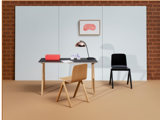
Figure 4. Reflective presentation of furniture by HAY, 2016. In its furniture catalogues, the company HAY presented the furniture in a setting that breaks the illusion of the image as immediate access to the objects depicted on the image. In doing this, the catalogue designers present an image that both informs and provides a means for viewers’ reflective meaning construction. Photo used with permission.

Roman Jakobson (1960) labeled this the “poetic function” of language. Even if originally attached to language, this aspect of making the code of communication visible in the act of communicating can be transferred to other media.