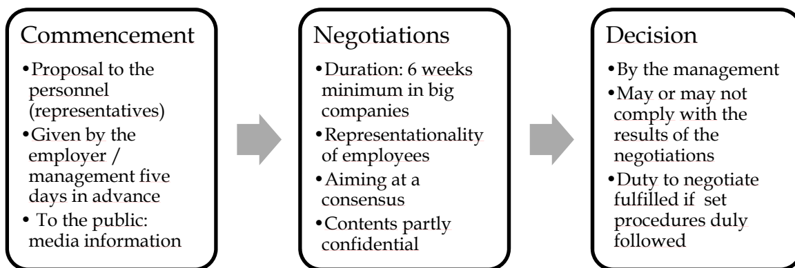
Figure 1. The process of co-operation negotiations

For the purposes of the present study and in relation to management-by-fear, there are four interesting features within the process: 1) the role of the employer (management), 2) the role of information and confidentiality, 3) the role of the employees (representativeness) and 4) the concept of “fulfilment of the duty to negotiate” (Act on Cooperation § 51).