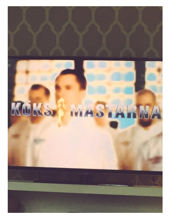
Figure 2: Isac Elliot's photo of Köksmästarna

Based on its topic and the initial activity of indirectly promoting fans in a specific location to play Isac Elliot's songs on Spotify, the beginning of this tweet is very similar to Example (10) discussed in Section 5.1.3 as well as numerous other tweets posted during the period of data collection. The attached picture in the tweet (Figure 2), instead of being the typical screenshot of a Spotify chart or a link to the song on the streaming service (as was the case in Example (10)), is of a television on which the Swedish television show Köksmästarna ('masters of kitchen', a Swedish version of the popular kitchen reality television shop Top Chef ) is airing.