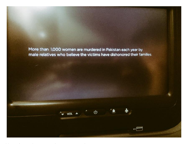
Figure 3: Isac Elliot's photo about a charity campaign: More than 1,000 women are murdered in Pakistan each year by male relatives who believe the victims have dishonored their families.

The topic of Example (26) diverts from Isac Elliot's usual tweeting habits, as most of his tweets are about interacting with fans and promoting the consumable aspect of his persona, which can be regarded as light topics. However, in Example (26), Isac Elliot directs attention to a more serious matter. Celebrities often campaign for different charities, and these practices can be regarded as image management – by focusing on social issues, Isac Elliot's is able to extend his image beyond that of a teenage idol to that of a serious advocate.