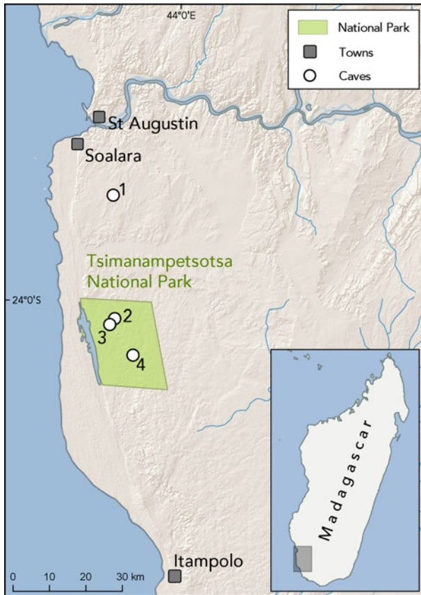
FIG. 1 Map of the study area with the four sacred caves surveyed (white circles) and the main towns in the area (dark squares). Specific names and locations of the sacred caves are not provided in order to protect the bat colonies. Specific names and locations of the villages where interviews were conducted are not provided in order to protect the anonymity of the interviewees.

et al., 2010), whereas others suggest that the cultural values underpinning these sites are eroding (Golden & Comaroff, 2015a; Kingston, 2015). It is also unclear whether these island-like refuges can effectively protect mobile species that forage beyond the boundaries of sacred sites. Thus, the effectiveness of sacred caves in conserving bats cannot be taken for granted if spiritual values become eroded.