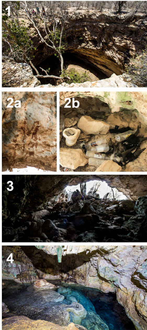
PLATE 1 Entrances of the four caves surveyed in this study. Numbers correspond to the locations in Fig. 1. 2a–b show some of the ritual offerings found in one of the sacred caves: blood of a sacrificed black goat and bottles of locally brewed alcohol (e.g. toaka gasy ) for the spirits.

taboos; Fig. 2a). Nevertheless, the lack of knowledge of conservation policy and related legal regulations was high, with 39% of respondents expressing confusion about what was protected, where and, most notably, by whom. Although many local people recognized the functions of the National Park in conserving bats, others complained about recent changes in regulations limiting their access to sacred caves. Park management rules allow certain cultural uses (e.g. sacred rituals), but many informants expressed concerns about having lost cultural connections to spiritual