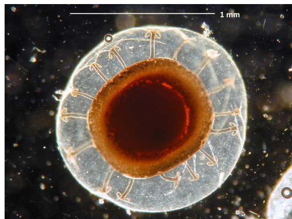
Figure 2. Hooked overwintering stage (statoblast) of Pectinatella magnifica . Visible is the “hyaline albuminoid mass” as described by Allman (1856, p. 82) or “cuticle” enclosing the spines and forming a “floatation ring” as illustrated by van der Waaij (2017) for Cristatella mucedo ( http://www.microscopy-uk.org.uk/mag/artfeb10/mw-bryozo_statoblasts.html ).

Perhaps as a manifestation of this tendency, P. magnifica has been recorded recently from several locations in the Vuoksi watercourse in eastern Finland, quite distant from the previously known more southern range of the species. This finding is somewhat unexpected considering the species is suggested to prefer warm waters. In their review, Pienimäki and Leppäkoski (2004) did not list the species even as a potential invader into Finnish inland waters.