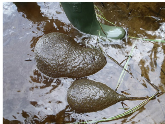
Figure 1. Late summer Pectinatella magnifica colonies attached to common horse-tail ( Equisetum fluviatile ).

Historically, Finnish inland waters have not been prone to invasions by non-indigenous species because the low water temperatures, low nutrient concentrations, and soft water have formed natural barriers against invasions (Pienimäki and Leppäkoski 2004). Nowadays, environmental change (climate warming, nutrient enrichment) and greater international shipping are increasing the opportunities for species invasions that can endanger the ecological integrity of aquatic ecosystems (Pienimäki and Leppäkoski 2004).