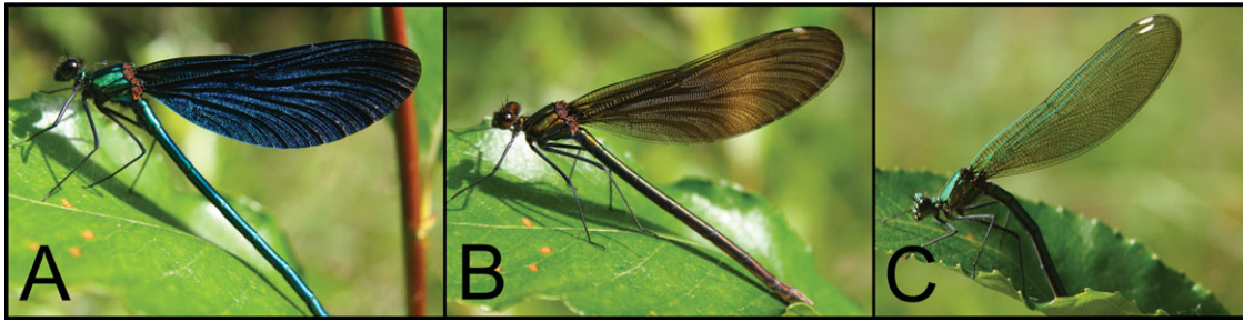
Figure 1. The study species. (A) Calopteryx virgo male and (B) female, and (C) C. splendens female. Note that the scale of the photographs differs.

C. virgo males, 22% of the males court them, suggesting that C. virgo males have relatively poor species discrimination (Tynkkynen et al. 2008).