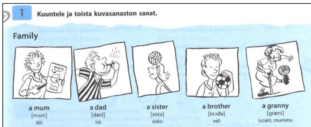
Figure 3. Extract from the vocabulary list in All Stars 3 Activity book (Benmergui, Sarisalmi, Alamikkela, Granlund, & Ritola, 2010, p. 29).

Grammar is always introduced in Finnish, though it is supplemented by English examples. The vocabulary and phrase lists that include the main terms to be learnt in each chapter are in most cases bilingual, with the terms given first in English and then in Finnish. It is only in the third grade books that images (drawings) are also added to the vocabulary lists (Figure 3).