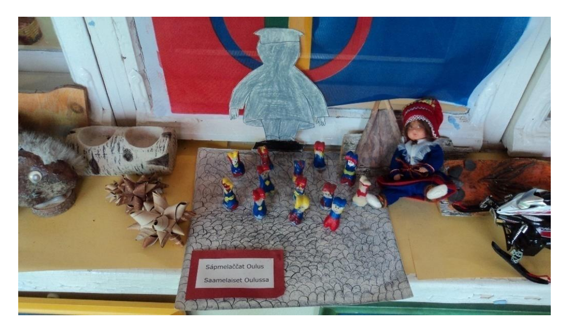
Figure 2. Constructing the idea visually "Me as Sámi in Oulu".

the heart of the city, are Sámis: it is clear from the traditional Sámi dresses they are wearing. This composition conveys the message that the Sámis are not only part of the city, but they are an active and visible community, too.