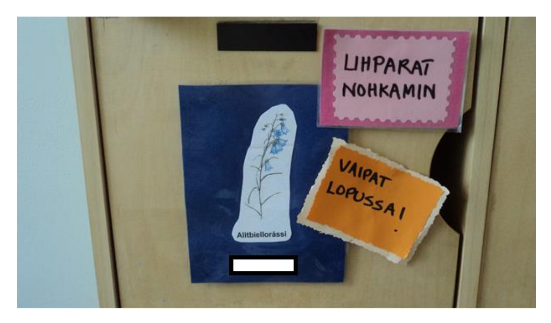
Figure 1. Messages to the parents in two languages.

In the kindergarten teachers tried to use Sámi with the parents as well. They often had conversations based on resources from both languages; the parents with passive knowledge mainly answered in Finnish while the teacher spoke to them in Sámi. Resources from both languages were also present on the visual level, as it can be seen in Figure 1. Depending on the language competencies of the parents, the teachers left messages to the parents in Sámi or in both languages on the children's lockers. In the picture we see the message 'Diapers running out!' above in Sámi and below in Finnish. With the use of both languages it is ensured that the parents understand the message and at the same time they can acquire the Sámi version. The physical position of the texts indicates that the Sámi has a higher prestige in the group than the dominant language.