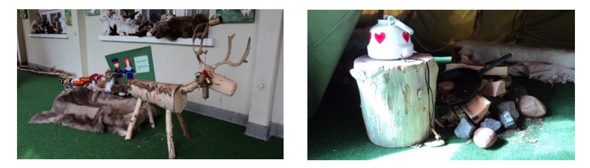
Figures 5 and 6. The toys in the "Sámi land".

In the interviews this physical space turned out to be the symbol of "authenticity", the embodiment of "historicity" and a site of "exoticness" at the same time. The teachers of the Sámi group stressed that each object in the room was brought from the North, and by spending time in this authentic learning environment and playing with the toys (such as the symbolic sledge in Figure 5 or the more modern cooking devices in Figure 6) the children get the feeling of the "original" Sámi lifestyle. Contrarily, in a parental interview the room embodied historicity by providing information about an earlier life. For the other groups, who regularly visit this room, "Sámi land" is mainly a fascinating and exotic site for playing.