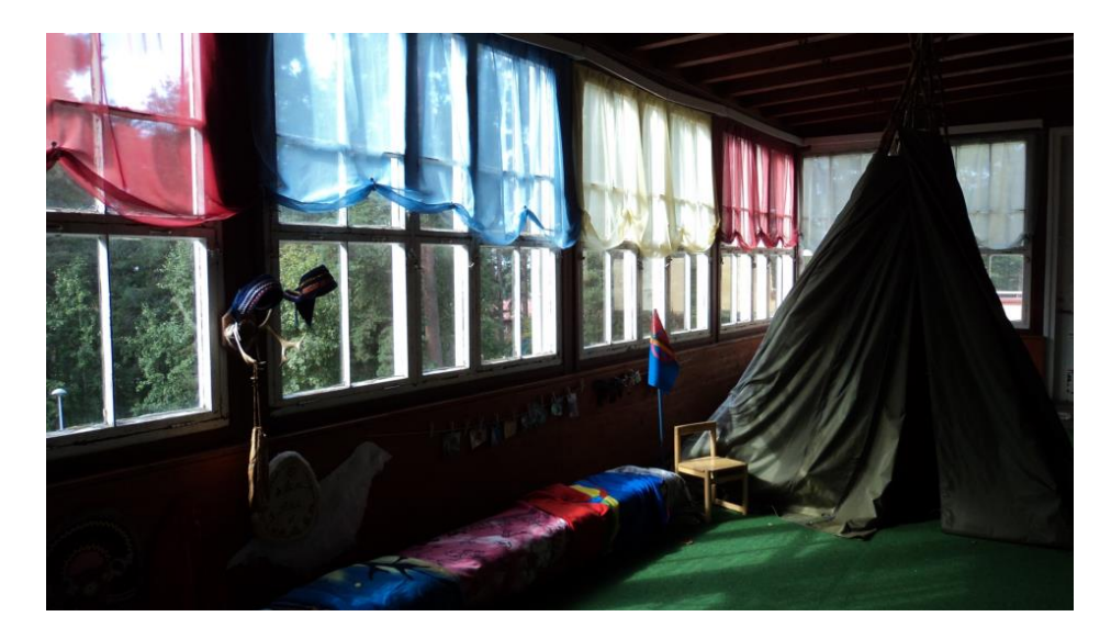
Figure 4. The "Sámi land".

In the interviews this physical space turned out to be the symbol of "authenticity", the embodiment of "historicity" and a site of "exoticness" at the same time. The teachers of the Sámi group stressed that each object in the room was brought from the North, and by spending time in this authentic learning environment and playing with the toys (such as the symbolic sledge in Figure 5 or the more modern cooking devices in Figure 6) the children get the feeling of the "original" Sámi lifestyle. Contrarily, in a parental interview the room embodied historicity by providing information about an earlier life. For the other groups, who regularly visit this room, "Sámi land" is mainly a fascinating and exotic site for playing.