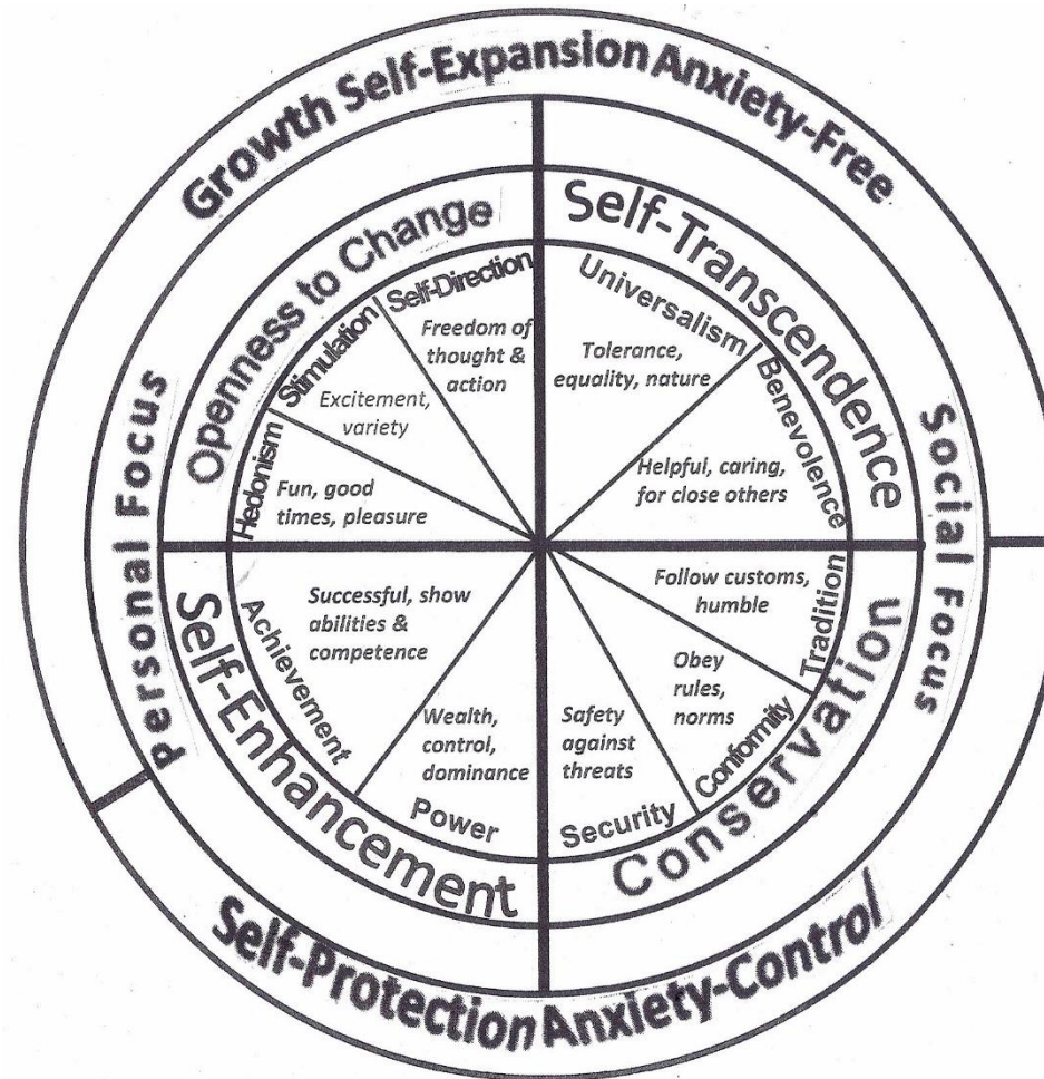
Figure 1. The circular structure of ten basic values, four higher order values, and two underlying motivational sources (adapted from Schwartz, 2015).