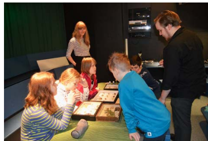
Educational activities for young students are central to Jyväskylä University Museum's teaching mission. Here, students explore the Natural History Museum's butterfly collections.

The University Act reformed the Finnish universities 2010, improving the quality of teaching and research, and increased competitiveness. In conjunction with the new law, state-owned university campuses, including buildings, parks and gardens, were handed over to a real estate company, which is now responsible for overseeing the premises for the new university organization.