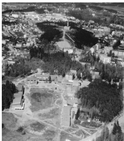
Jyväskylä teacher training seminary was built in the early 1880's outside of the city center on a wooded hill near water, according to Central European models. Observing and enjoying nature was integrated into seminary education. The photo depicts the older Seminary buildings in the middle of a forest, and the water tower, which now holds the Natural History Museum, on the hill. The Alvar Aalto-designed campus was built in the 1950s, and surrounds athletic fields. Photo: taken 1958, Jyväskylä University Museum Collections

As the museum has opened its collections more widely to the public, visitor services has diversified its offerings, and new full time employees have been hired to assist in running the organization. A museum shop now operates in both parts of the museum. The museum's objectives are now focused on operating in a transparent manner, and on serving the University community. The opening of national borders following World War II and the rapid development of information technology has led to an increasingly pluralistic society in which people have increasing freedom of