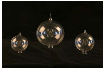
These unique artefacts from the Jyväskylä University Museum collection are resonators used to identify various frequencies or musical pitches present in music and other complex sounds, and were used to teach physics at the Jyväskylä Teacher Seminary. Former teaching tools are an integral part of Jyväskylä University Museum's collections, which houses nationally unique objects related to the history of Finnish teacher training.