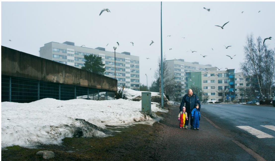
Figure 3. Julius Koivistoinen (2011). Kontula, Helsinki . #9 from series Terrarium, Everyday paradise . Reprinted with permission.