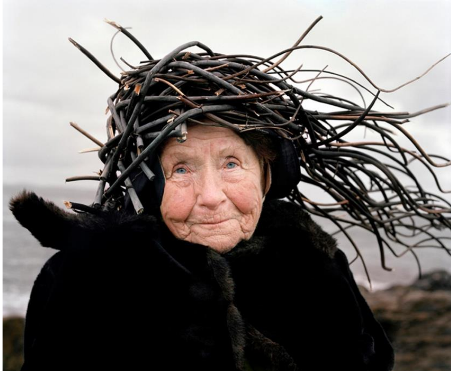
Figure 4. Riitta Ikonen & Karoline Hjorth (2011). Eyes as Big as Plates # Agnes I. Reprinted with permission.