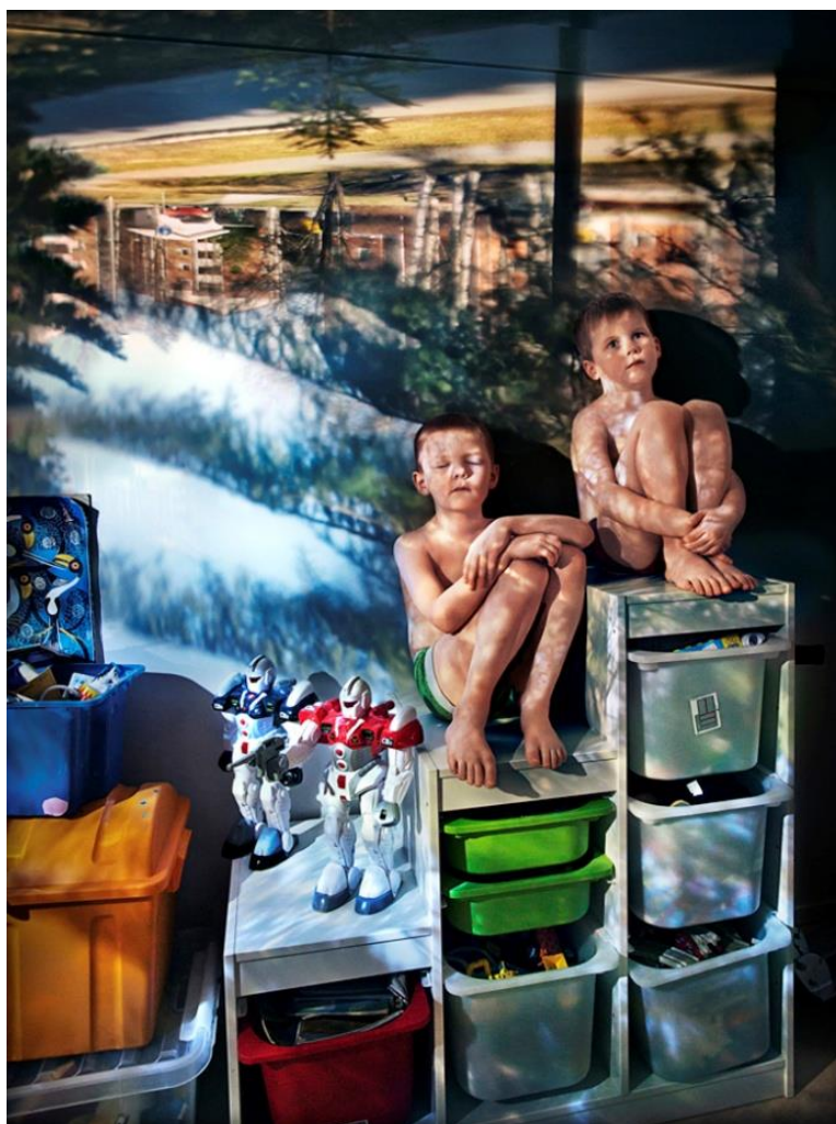
Figure 1. Marja Pirilä (2013). Camera Obscura/Alvar and Erik, Rovaniemi. Reprinted with permission.

The presentation of the findings includes data excerpts of the accounts presented in the discussion of the following five photographs (Figures 1-5). I chose to introduce these five specific photographs out of thirteen, because the discussions they provoked, exemplify the salient features of the preschoolers' accounts.