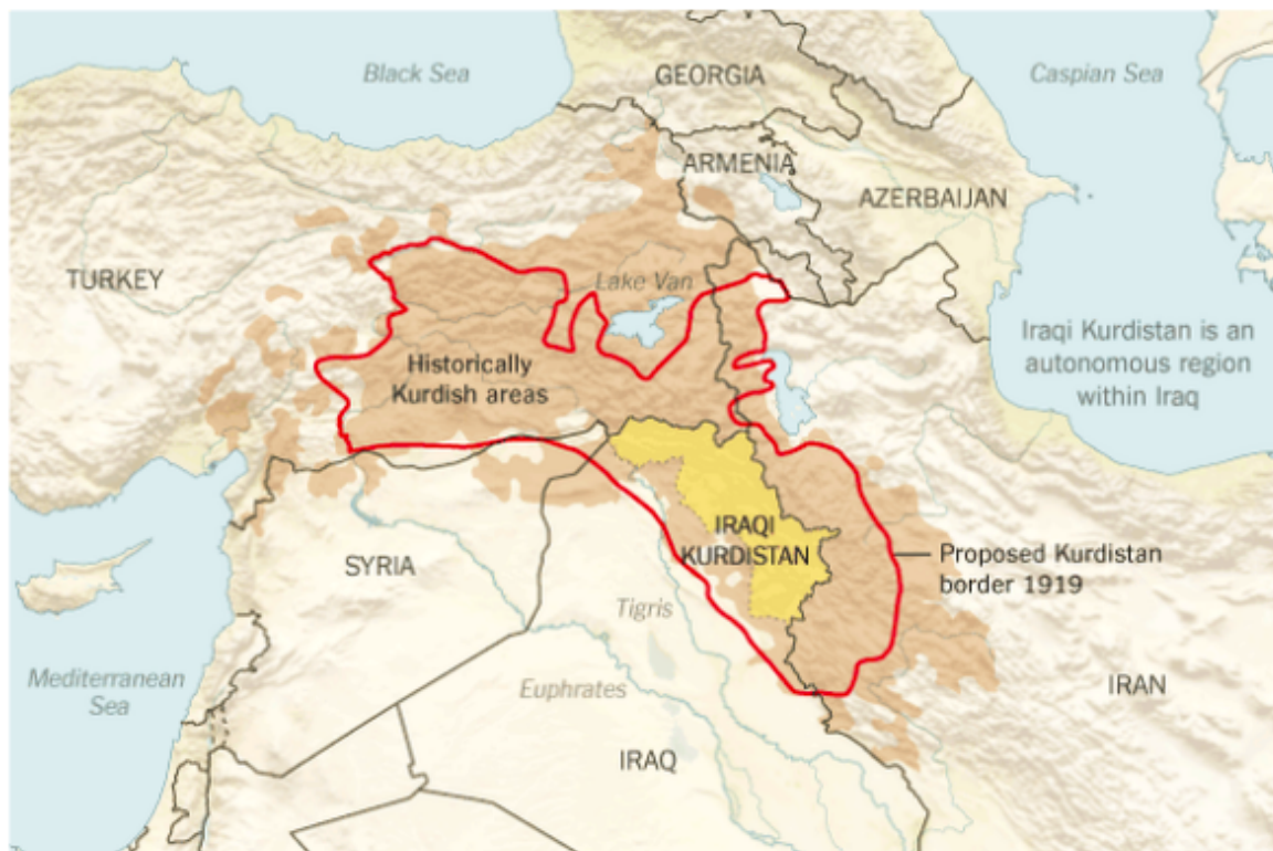
FIGURE 1: Map showing Kurdish populated areas across Iran, Iraq, Syria, Turkey, and Armenia (The New York Times, July 2014).

Kurds. However, beyond this area, the same land can be referred to as “Southern Kurdistan”, with the term “Kurdistan” broadly implying the region of approximately 200,000 mostly contiguous square miles where a majority Kurdish population can be found straddling the four nation states named above (ibid., p. xii & Izadi, 2015, p. 1). Kurds find commonality in claiming a shared ancestry, which is “possibly fictive”, and in a shared language, despite difference of dialects and scripts across geography, and common linguistic classifications of the different varieties of spoken and written Kurdish as “related languages” rather than strictly as dialects (McDowell, 2007, p. 3).