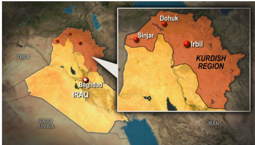
FIGURE 2: Map showing location of Sinjar in Iraq, with relation to major Kurdish cities. Note: ‘Kurdish Region’ depicted represents areas of majority Kurdish-speaking population rather than official boundaries of Iraqi Kurdistan or extent of KRG control (PBS, August 2014).

degree of social and cultural uniformity” (Allison, 2001, p. 4). Further, Yezidi history does have notable overlaps with Kurdish history, especially in eastern Turkey, as evidenced by oral traditions describing significant historical events (ibid., p. 5).