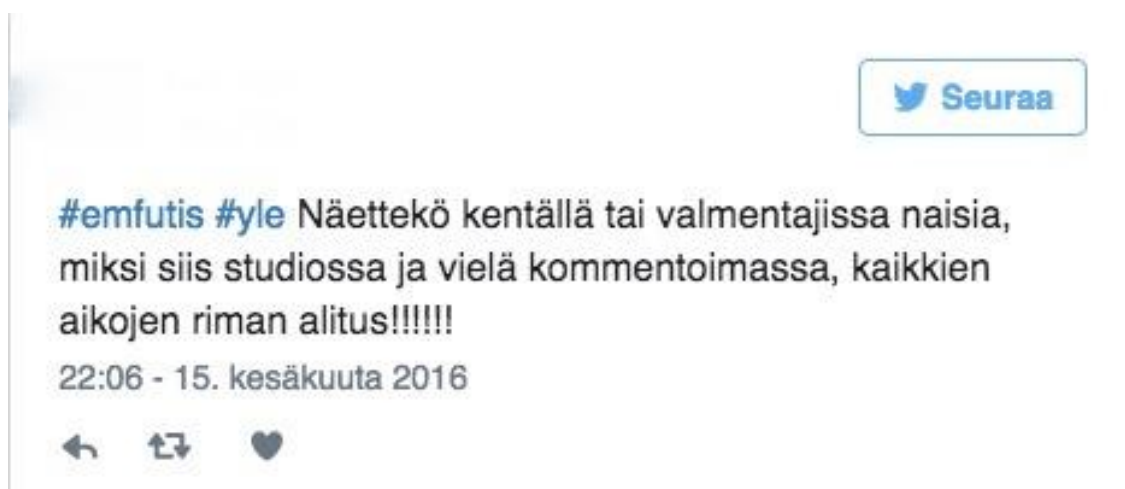
Image 1. “Can you see women on the field or as coaches, then why in the studio and commenting, an all time low!!!!!!” Tweet about a Finnish female commentator during the 2016 football European Championships. (Ice Tiki 2016)