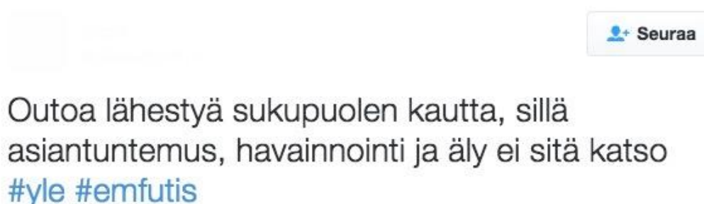
Image 2. “Strange to approach through gender, because expertise, observational skills and intellect do not concern gender.” Tweet about the discussion on female commentators during the 2016 football European Championships. (MDA 2016)

Female coaches are still seen as anomalies in male dominated sport, especially as the coaches of male teams. This is evident through the discussion that arose when a female commentator was commenting on men’s football games during the European Championships in 2016. What was notable about the discussion was that the criticism was not related to the coach’s skills as a coach, expertise or other abilities in any way, but simply her gender e.g. Image 1. As can be seen from Image 2, female coaches do not only receive criticism and negative feedback from the public. The public discussion became very heated because many people began to tweet about the competency and skill of the female commentator. It was however interesting how the discussion was still very centred around gender rather than skills or merits. As one of the other coaches in my study also pointed out, media is not the only source of criticism. One of the