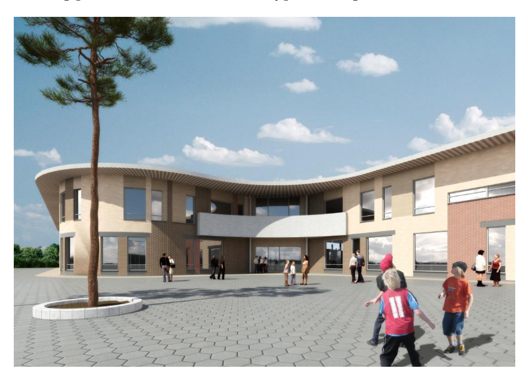
Figure 1. Ritaharju multipurpose centre in the planning phase.

The residential community of Ritaharju was also being constructed by central actors promoting the so-called future school project. This "future school discourse" highlighted the school in the new multipurpose centre as the jewel of the City, and as also serving the whole community more broadly. In this discourse, novel aspects of pedagogy, technology and design were introduced as providing fruitful affordances for pupils to engage in active learning in an open and supportive environment without the constraints of a gated classroom and traditional models of teaching. At the time of the discourses survey, the centre was still under construction and the school only envisioned in anticipatory talk. Figure 1 illustrates the architect's view of the multipurpose centre in the planning phase. The picture echoes the voices of the time, highlighting the centre as a meeting point for users of different types and ages.