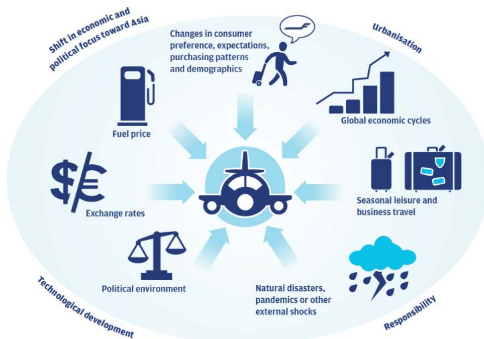
Figure 3. The diagram on page 10 of the annual report.

In the previous section, I argued that text-flow is the dominant semiotic mode in the six-page sequence. Next, I expand this discussion by attending more closely to the second topic identified in this sequence, that is, megatrends affecting Finnair and the airline industry (see Figure 1). More specifically, I focus on transductions and transformations of meaning – in this order – while also considering the constraints imposed by various agencies on these processes.