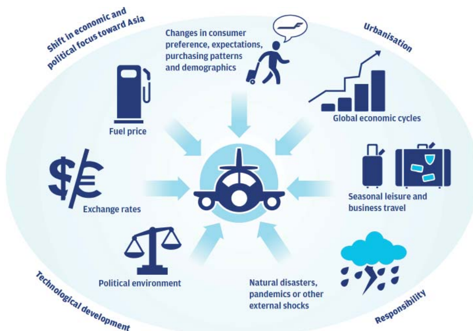
Figure 3. The diagram on page 10 of the annual report.

In the previous section, I argued that text-flow is the dominant semiotic mode in the six-page sequence. Next, I expand this discussion by attending more closely to the second topic identified in this sequence, that is, megatrends affecting Finnair and the airline industry (see Figure 1). More specifically, I focus on transductions and transformations of meaning – in this order – while also considering the constraints imposed by various agencies on these processes.