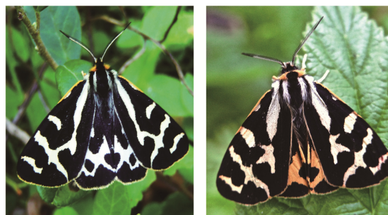
Fig. 1 The two male morphs of the wood tiger moth, white (left) and yellow (right).

As capital breeders (Tamaru and Haukioja, 1996), wood tiger moths do not feed in their adult stage and have therefore a short lifespan. They are polyphagous,