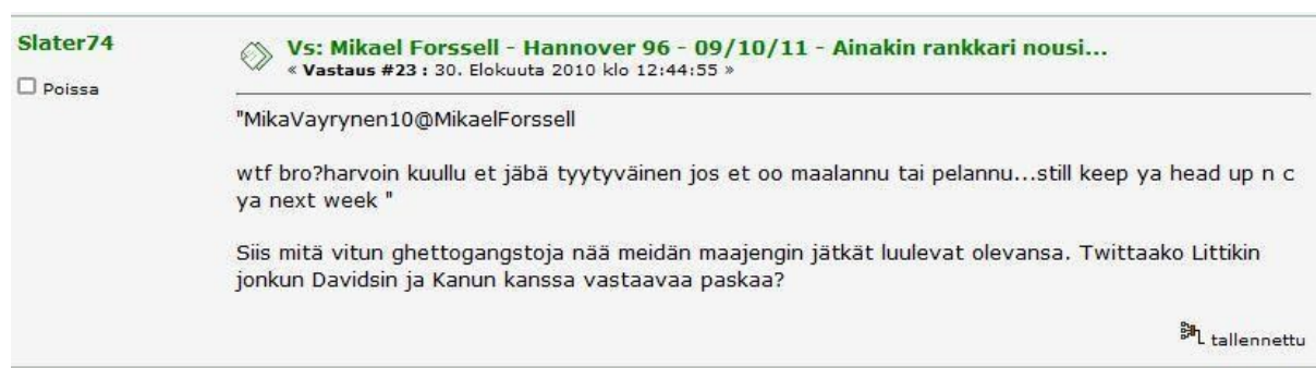
FIGURE 8. "So, what fucking ghetto gangstas"

When Väyrynen and Sparv join Forssell in the social activity of Twittering, the three players' tweets are often explicitly directed at each other (while simultaneously maintaining their personal, specific online audiences); one of the tweets directed at Forssell by Väyrynen elicits a negatively framed criticism of 'ghetto gangsta' among the Futisforumists (Figure 8).