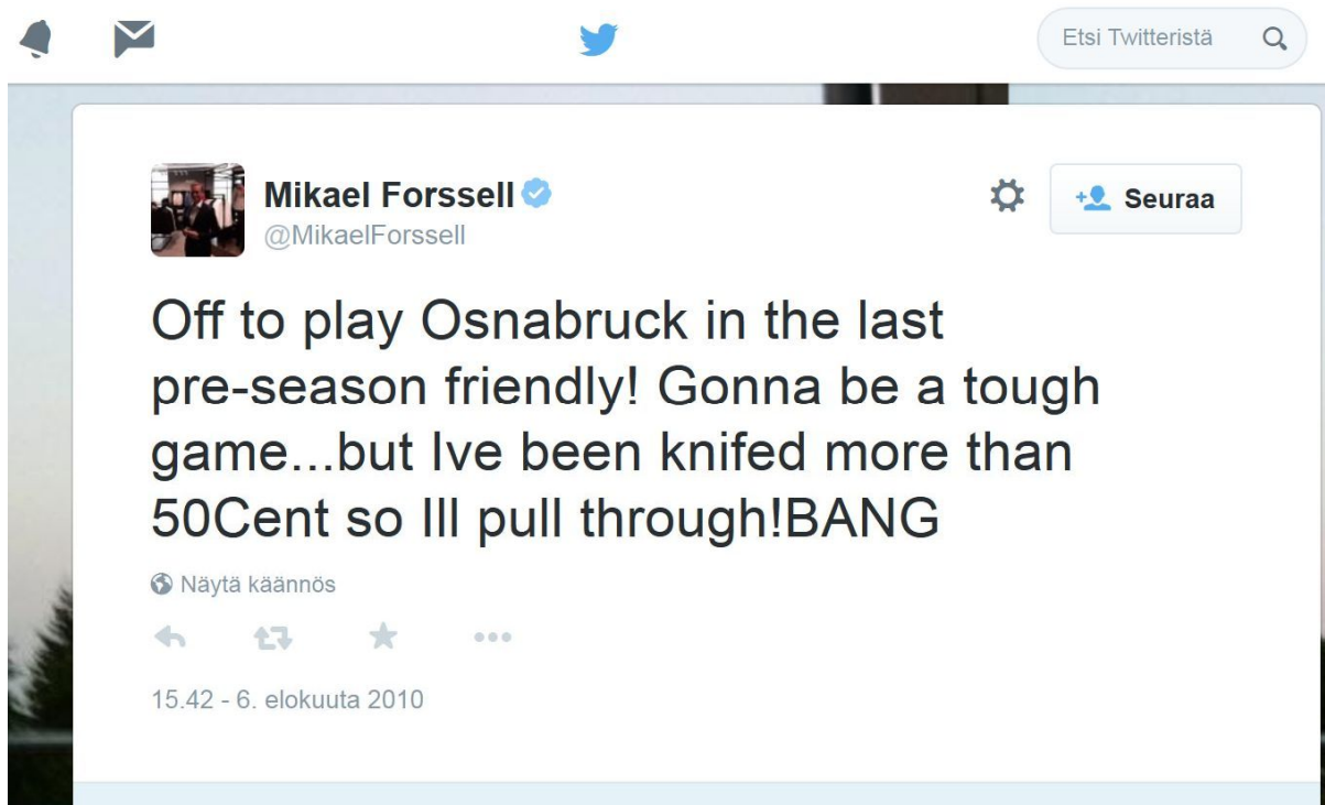
FIGURE 4. "...but Ive been knifed more than 50Cent".

This tweet again reflects Forssell's publicly displayed rap fandom. His first sentence, whilst elliptical, is in rather Standard English, but the second sentence moves toward a more informal register ('Gonna'; 'tough'). However, the clause beginning with 'but' is a clear switch to 'gangsta' content, emphasized by the cultural reference to 50 Cent 10 and the closing exclamation 'BANG'. The activity of 'knifing' here can, ironically, refer to two things: surgery that an often-injured footballer such as Forssell has had to undergo, or 'stabbing' in a metaphorical sense (i.e., receiving harsh criticism from media and fans). Moreover, the third meaning is literal, as stabbing was part of 50 Cent's life experience in the violent world of US gangsta rappers. In this sense, then, Forssell's 'comparison' of having been knifed more than 50 Cent suggests, in a somewhat humoristic tone, that he is even tougher than the gangsta rapper, albeit in a different context. In spite of the macabre verbal imagery, the tweet ends in a jocular and highly optimistic, tongue-in-cheek note ("Ill pull through!BANG"). One overall function of Forssell's tweeting seems to be to entertain his followers, including old friends in Finland or other football players; here, the entertainment derives from a simultaneous orientation towards the norm centers of competitive football and 'gangsta' culture.