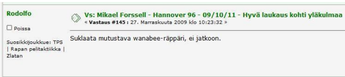
FIGURE 3. “Chocolate munching wanabee rapper, you’re out.”