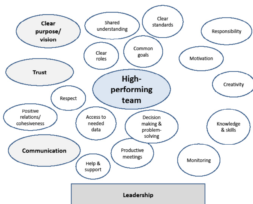
Figure 3. Framework – dimensions of high-performing teams based on this study

Based on the source literature, high-performing teams have been thoroughly studied in the past two decades, starting with initial intense interest in the 1990s, although there have not