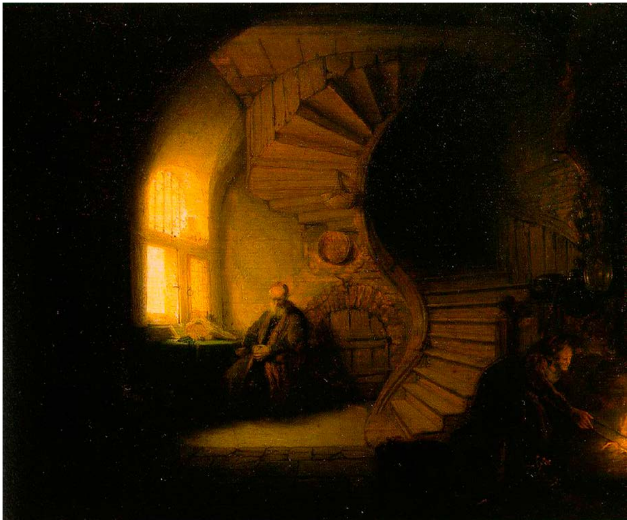
Philosopher in meditation , Rembrandt, 1632. Louvre Museum.