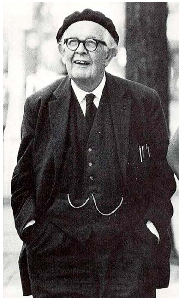
Jean Piaget at the University of Michigan campus in Ann Arbor, 1967 or 1968.

According to Piaget, development advances through stages of wider control over the physical environment. It is not, however, the only dimension of action. Human action always takes place within some limits: we can only act under certain constraints. What keeps development going is that we are forced to change and modify our actions. Pressure for change is thus like a compelling driving force that promotes development. We have to change our operational patterns and schemes when we find ourselves in a situation that is beyond our understanding in terms of existing knowledge. This, seemingly, is a matter of two qualitatively different phenomena, one of which is relatively stable while the other one is a destabilizing element. Piaget describes these elements by means of the concepts of accommodation and assimilation. Development is possible only when an existing thing gives way and at the same time the phenomenon is reshaped. Every structure of activity, as of thinking, needs to be seen as a specific