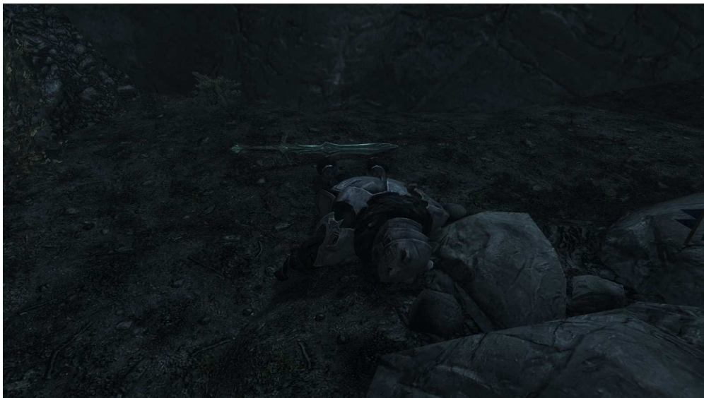
The mighty Dragonborn, dead from falling down a cliff in The Elder Scrolls V: Skyrim (Bethesda Game Studios, 2011) 677x381mm (72 x 72 DPI)

1 2 3 4 5 6 7 8 9 10 11 12 13 14 15 16 17 18 19 20 21 22 23 24 25 26 27 28 29 30 31 32 33 34 35 36 37 38 39 40 41 42 43 44 45 46 47 48 49 50 51 52 53 54 55 56 57 58 59 60