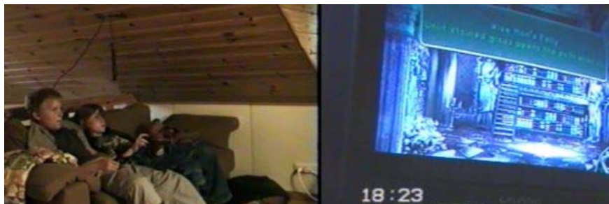
Fig. 3. Wise man's folly. Unlit stained glass opens the path when lit.