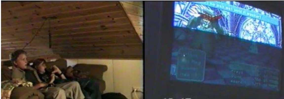
Fig. 1. Quina: I no can eat until weaker.

2 P +↓din↑din↓din↑din↓din↑din (.) +((points to 'attack' on command menu -->))