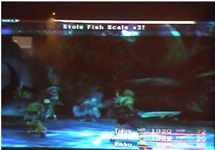
Figure 4 Stole Fish Scale x 2.