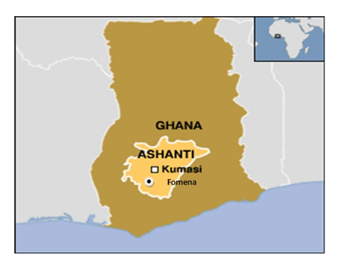
Figure 2 Geographical locations of the two selected schools