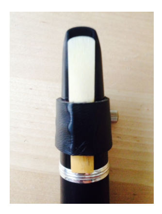
FIGURE 5: Reed is replaced lower to get only murmur

Imagine that the instrument is like a Christmas three, you blow in the top of the tree and air is coming from every hole from the instrument. The lower the air goes, the wider the Christmas tree is.