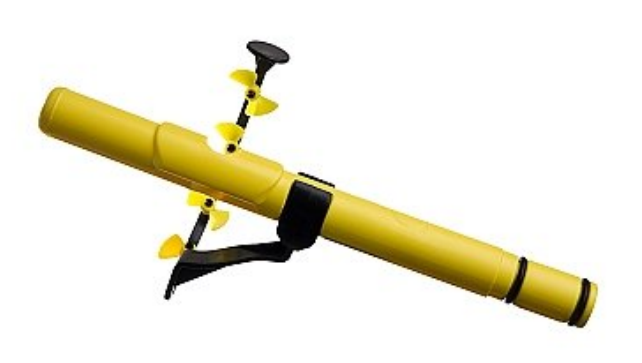
FIGURE 4: Pneumo Pro Wind Director Practice Tool

Flute players can use a special instrument with a propeller for to get blowing into correct angle. If the blowing is right, only specific propellers spin. This plastic exercise tool doesn't give hardly any resistance and doesn't interest for long, but is a great assistant getting the maneuver to the instrument correct.