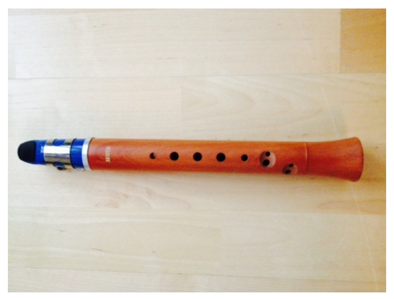
FIGURE 7: Saxonette

Jaana Lehikoinen (2011) had written in her Master's Thesis about variation among COPD patients. Depends on the patient is strong pressure wind instruments or on the contrary lower pressure instruments air resistance after big inhale more beneficial. To be sure we started with most low air pressure I could figure, saxonette.