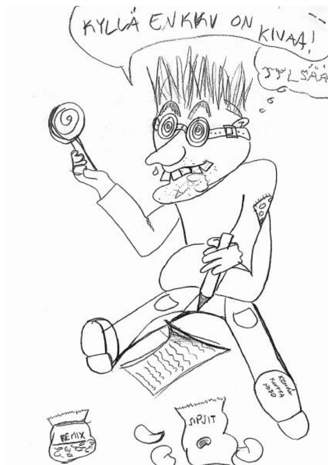
Figure 4. English is such fun! Boring

The drawings seemed to invite more ironical, ambiguous, and multi-voiced representations of being a learner than written questionnaires and interviews. This could be due to cartoon and comic strip styles that the pupils were familiar with.