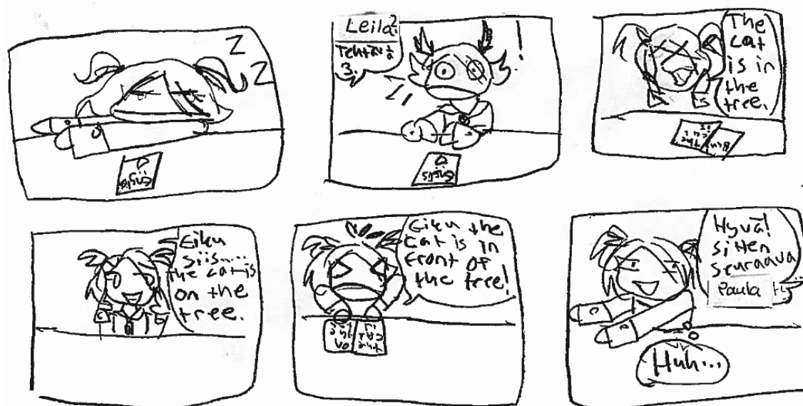
Figure 5. Phew...