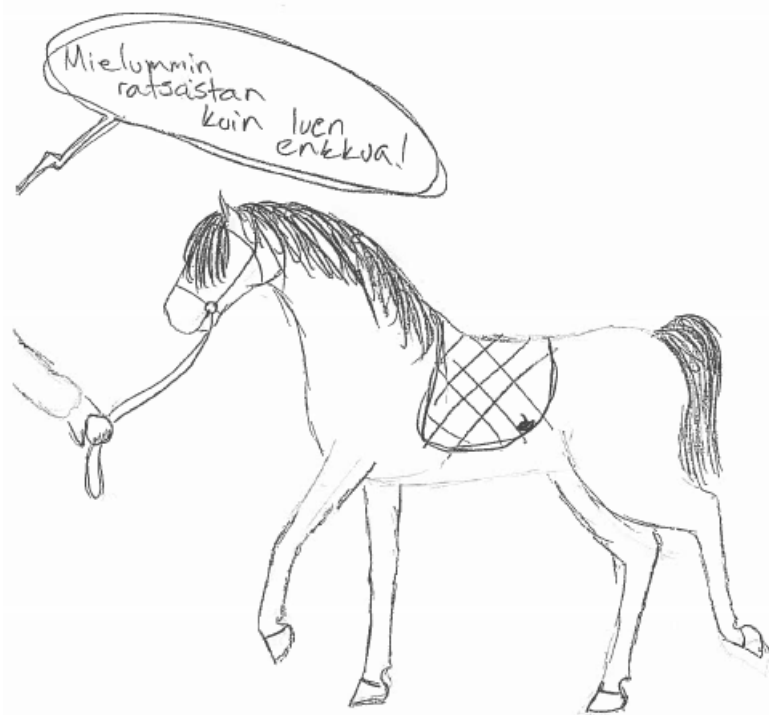
Figure 2. I'd rather ride than study English

In Figure 2, taken from the pupils' self-portraits as language learners, a passive fifth grader wrote in Finnish: I'd rather ride than study English! This reveals a contradiction in meanings the pupil gives for studying English and self-chosen free time activities.