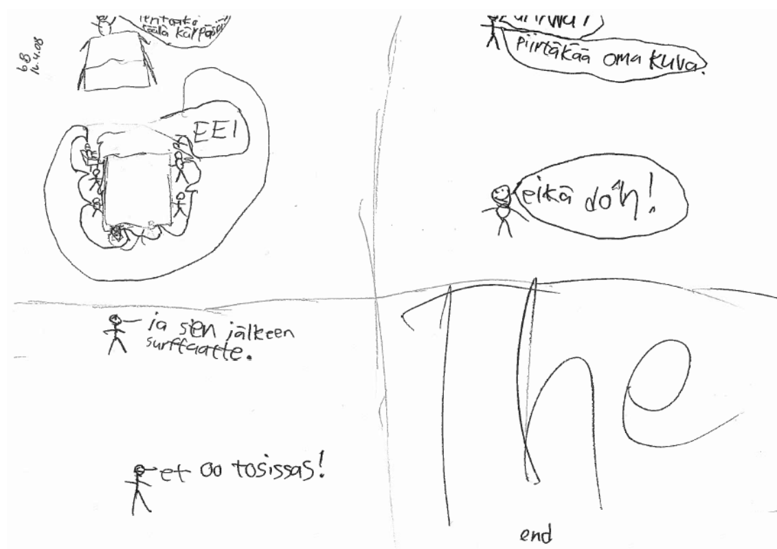
Figure 6. Are there flies flying about here?

In this self-portrait, the pupil expresses both his individual frustration and collective resistance targeted at the institutional norms of not disturbing the lessons and complying to teacher's instructions. This kind of resistance might have gone unnoticed in a classroom situation, but the comic strip made it visible because the genre allowed it.