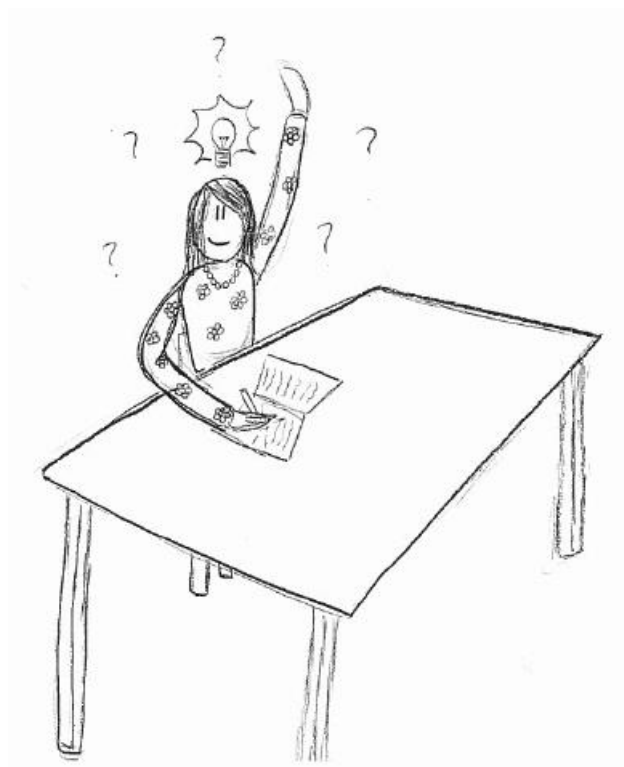
Figure 3. The “good language learner”

Speaking English and presenting positive orientation towards studying the language were seen as presentations of being a “good language learner”. Especially the fifth graders reported about their interest in and enthusiasm about studying English. Some of them described themselves in the questionnaire as happy English learners, which suggests that they had positive attitudes towards studying the language. Although the sixth graders seemed less open about reporting their attitude, most of them regarded learning English as important. In spite of this, it was not always fun, which caused contradicting feelings and investment. For some pupils, the reluctance to express their opinion might have been affected by the fact that the researcher was also their teacher.