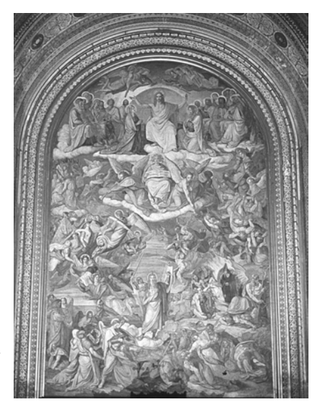
Figure 3: The Last Judgment (1836–40). Altar fresco by the German Nazarene painter Peter Cornelius (1783–1867). Ludwigskirche, the Catholic Parish and University Church St. Louis (1829–44), Munich.

The characteristics of the landscape of the midland lake region became the ideal for the Finnish landscape image par excellence. It was a matter of idealisation, where different landscapes or landscape pictures were just individual manifestations of the same idea (Waenerberg 2001). This idealised image seems to refer as much or even more to Hegel's concept of national art than to the previous, more Romantic Herderian notion of national landscape. This could also have something to do with Snellman, who rejected – what he thought to be – the Goethean wor-