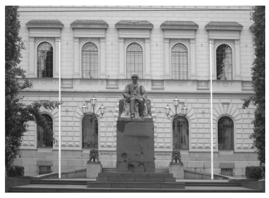
Figure 2: Johan Vilhelm Snellman. Monument in bronze from 1916 by the Finnish sculptor Emil Wikström (1864–1942). The Snellman Square in front the Bank of Finland.

Since the days of Snellman the nation-state and public societies, later foundations, have been the main supporter of art and artists. This does not mean political control in the same way as in totalitarian states; rather, a more unperceived unifying effect on the art scene and on the