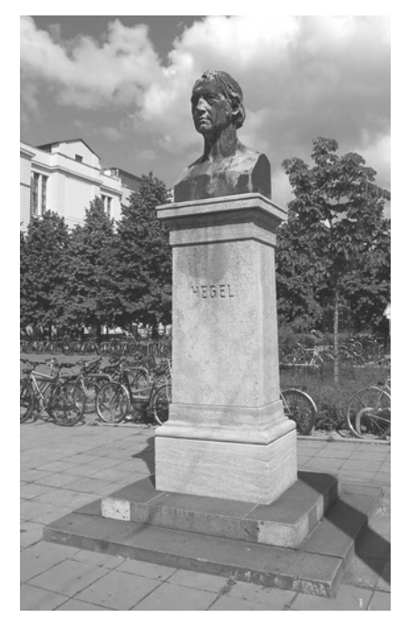
Figure 1: Georg Wilhelm Friedrich Hegel. Bust in bronze from 1872 by the German sculptor Gustav Blaeser (1813–1874) of the Berlin School. The Campus of the Humboldt University, Dorotheenstraße, Berlin.

The history of a nation is always inclined to get a noble origin attached to it. Germany was seeking its origin in ancient Rome and the great past of the Holy Roman Empire of the German nation, while Finland was looking for the roots of the nation in folk poetry. In Germany,