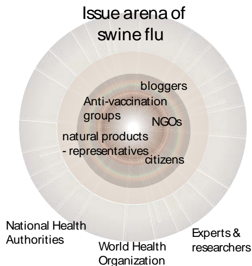
Figure 2. The online Issues Arena of the swine flu debate in Finland, autumn 2009.

Figure 2 visualizes that the central players online were individual citizens, bloggers, NGOs, anti-vaccination groups and representatives of natural products. The national health authorities, WHO and experts and researchers were left outside the discussion. In this study the traditional media arena was not investigated, but on the basis of the number of media releases, the authorities may be assumed to have had a stronger presence there.