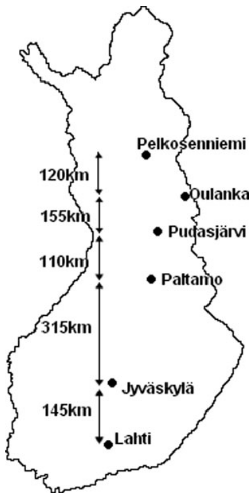
Figure 1. The study cline in Finland: the sampling localities and distances (km) between them.

populations, photoperiodic conditions, and the codes for the isofemale lines (progeny of one wild-caught fertilized female) is given in Table 1. The lines were maintained in half-pint bottles with malt media (Lakovaara 1969) under diapause-preventing conditions (continuous light, 19°C) for about six generations before using them in the experiment. After the establishment of the lines, the founder females as well as other flies collected from the cline populations were stored in 70% ethanol for use in the population differentiation analysis.