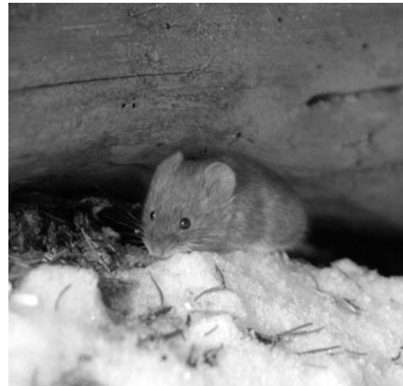
Figure 1. Study species, the bank vole Myodes glareolus is a small rodent species common in northern Europe. The main habitats are forests and fields, and the diet typically consists of forbs, shoots, seed, berries, and fungi.

We aimed to study the effects of past and present densities on the body mass, condition, and survival of young bank voles ( Myodes glareolus Schreber) (Fig. 1), by designing an experiment where individuals born in an enclosure population of 8, 12, 16, 20, or 24 adult individuals were transplanted in either a low (9–10 adult individuals) or a high (18 adult individuals) density enclosure to overwinter. We hypothesized that a change in population density would lead to a mismatch between an immediate adaptive response and future environment, and thereby to lowered individual fitness (Bateson et al. 2004). This idea parallels the concept of predictive adaptive responses (PAR) of human evolution, which states that organisms preset their physiology according to the cues of their prenatal environment in expectation that particular physiology will match their future environment (Gluckman et al. 2005). In our study, however, we cannot quan-