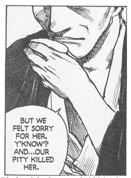
Image 4: Hiroaki Samura's Blade of the Immortal (1994–) is one of the many manga series that repeatedly hide parts of their characters' faces when it would be the most crucial for the reader to see them in their entirety. This frame from The Gathering storyline invites the reader to add the eyes and the emotion they could convey. The fragment-like image and the strong words in the speech bubble merely point towards possible directions. (Samura 2000, 18.)