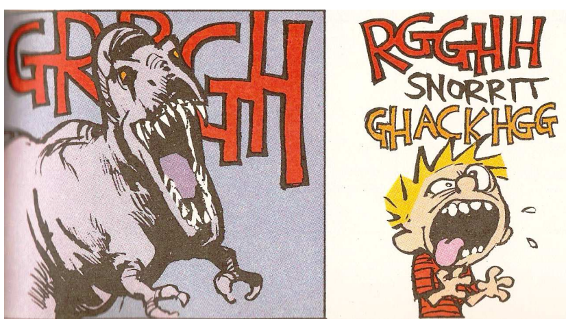
Image 3: Many Calvin and Hobbes strips are based on the mismatch between the fantastical worlds and creatures Calvin sees in his hyperactive imagination and what actually transpires around him. He frequently sees himself as well as the characters around him in a way that is both figurative and reflective of his rich inner world. Calvin's strong visual focalization even allows the artist, Bill Watterson to experiment with vastly different drawing styles. All in all, few comic book artists have used the technique as effectively as him. (Watterson 1995, 151.)