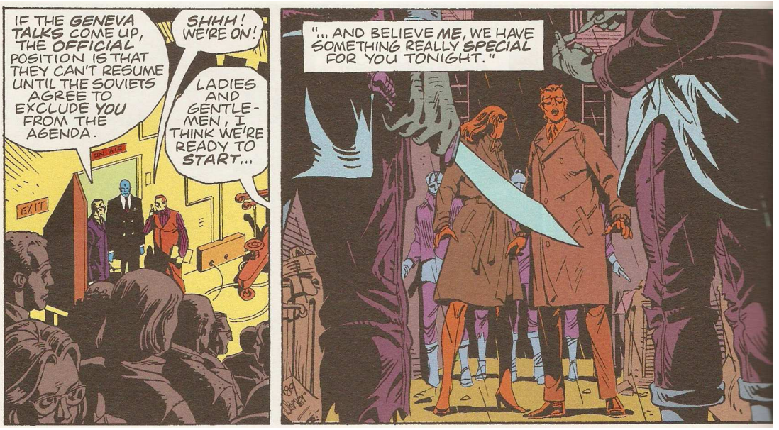
Image 6: This is just one example of the sinisterly humorous overlappings Watchmen bursts with. The emotional states and types of heroics different characters personify in these two scenes appear starkly contrastive due to their structural closeness. (Moore & Gibbons 1986–87, ch. III, 12.)