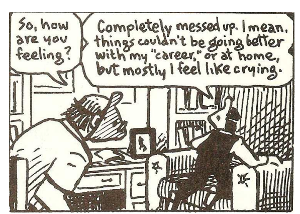
Image 9: Art Spiegelman's mouse-self shrinks into a child for a few pages. This underlines his role as a son but also visualizes the feelings of powerlessness and inadequacy he describes to his therapist in the scene. (Spiegelman 1991, II, 43)