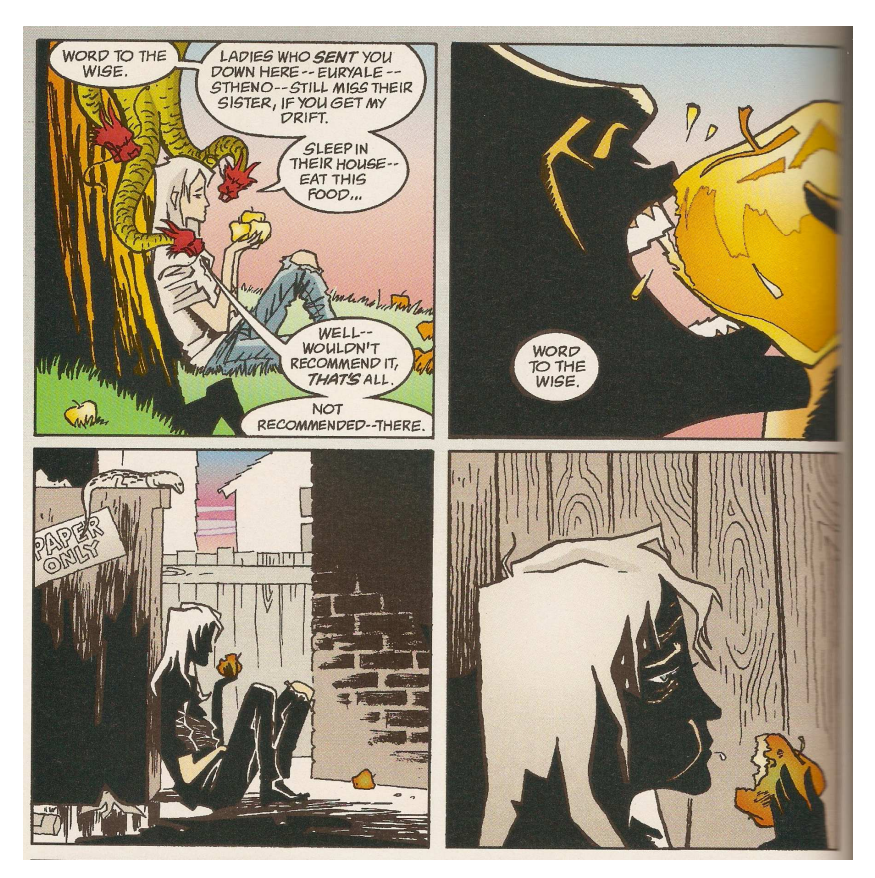
Image 2 : Hippolyta Hall's slide to insanity in The Kindly Ones is well illustrated through her wildly distortive focalization of her surroundings. Artist Marc Hempel starts indicating the change more subtly, with uneven linework and lack of color, but Lyta's visions finally develop into a full-blown parallel fantasy world. (Gaiman et al. 1996, ch. 4, 19.)