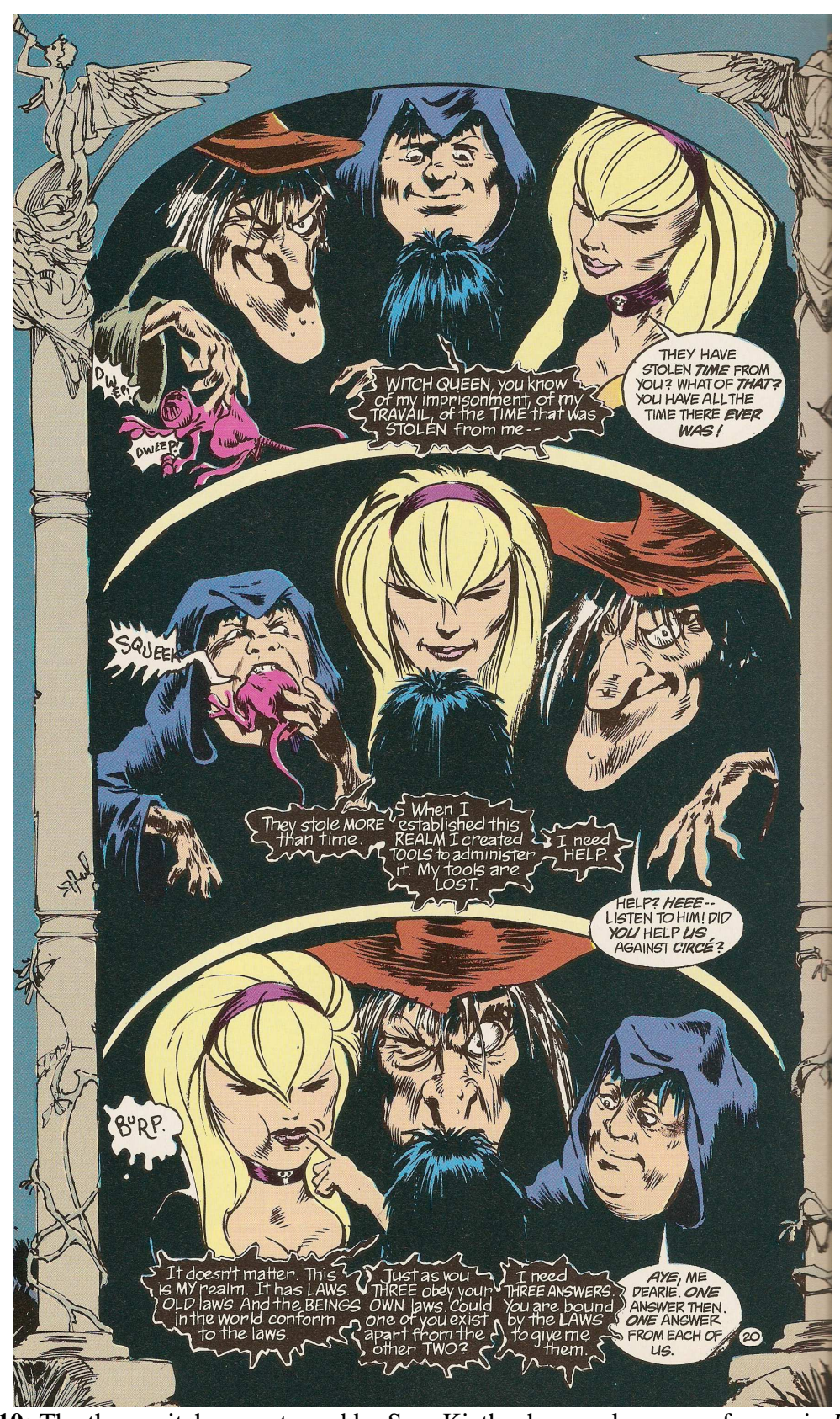
Image 10: The three witches, portrayed by Sam Kieth, change places – or faces – in Preludes and Nocturnes (Gaiman et al. 1991a, 74).