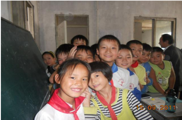
A happy class

a spontaneous and self-supporting community means responding to the inadequate public provision of education, provides the potential street children an educational shelter and prevents youth crime in cities. But beyond this, one has also to think the extent to which these schools are prepared for and capable of addressing students' learning needs, developing their potentials and facilitating the realization of their dreams.