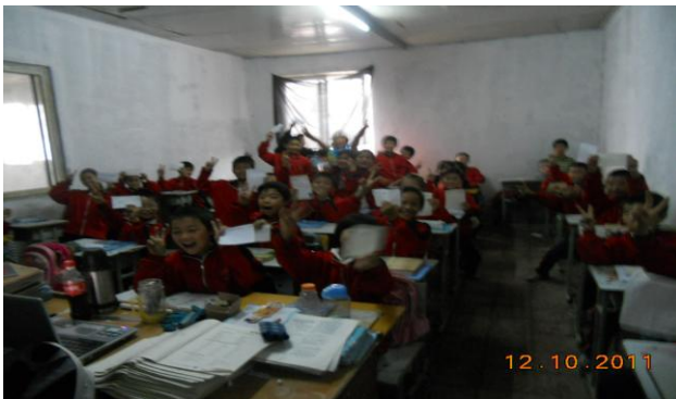
Showing the dreams!