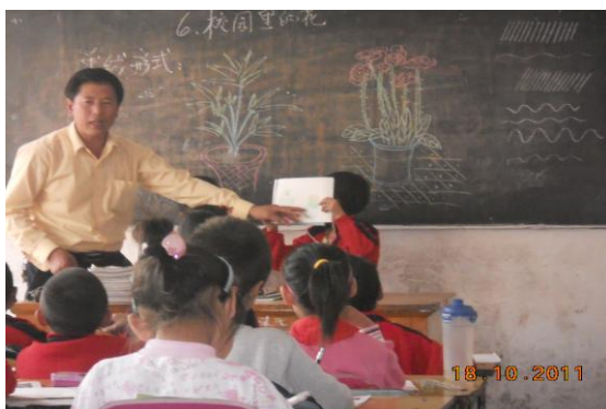
Students demonstrating works in arts class

competition was held among groups. Student representatives were invited to present their pictures in front of the class. The class burst out laughing when students interpreting pictures. The class finished in a vibrant atmosphere accompanying the hooraying of the winner group. After class, the teacher shared his teaching philosophy with me: “Interest is the best teachers. Even if the resources are scarce, we need to motivate students’ interests and passion. Who knows, maybe one of my students will become an artist in the future.”