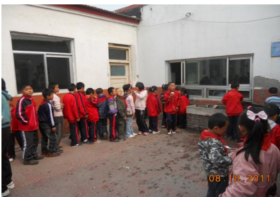
Students queuing up for lunch

Next to principal's office is the school kitchen. Lunch bought from a restaurant nearby is supplied in this very small kitchen room to around 500 students whose parents are busy working and can't make lunch. At 12pm, students queue up to get lunch from the kitchen window then go back to classrooms to eat. The meal includes vegetables, rice, and sometimes meat. Lunch price is around RMB4-5, acceptable by most parents. When asked one of my student informants whether or not she is satisfied with the lunch service, she said "Lunch is not expensive, and the quality is good. We can ask for more food if not enough .It would be better if we have a school canteen to eat instead of eating in classroom."