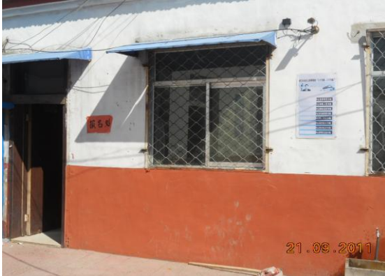
The principal's office and the only school office

(Goodburn, 2009). It is difficult to judge whether these regulations are put into school practices or just hanging on the wall rhetorically catering for inspection.