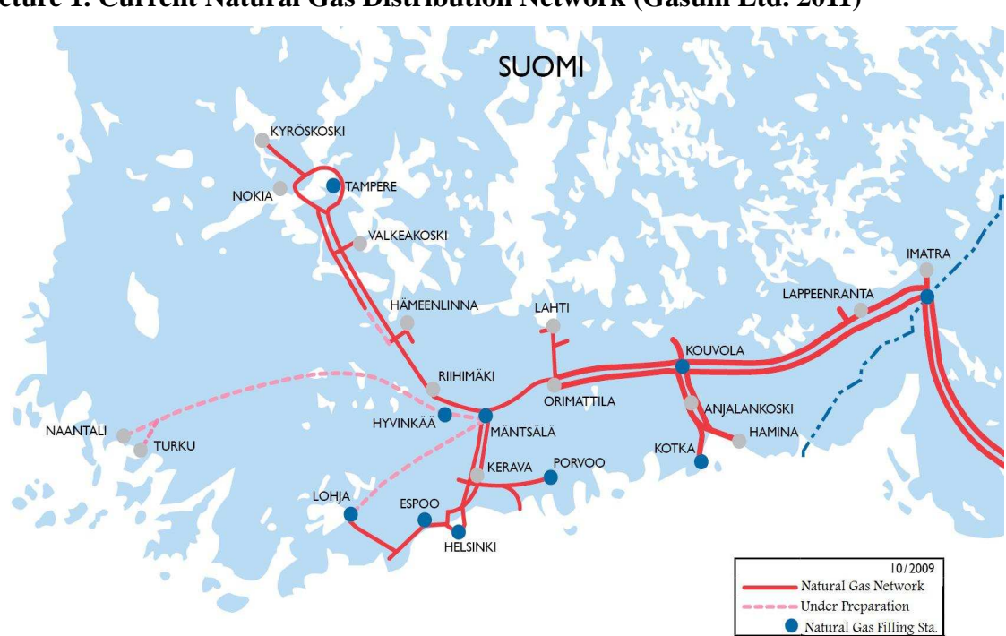
Picture 1. Current Natural Gas Distribution Network (Gasum Ltd. 2011)

stations), Espoo (two filling stations), Hyvinkää, Kotka, Hamina, Kouvola, Lahti, Lappeenranta, Lohja, Porvoo, Riihimäki and Tampere, have one filling station per city. Other filling stations that are not part of the natural gas distribution network owned by Gasum Ltd. are in: Laukaa (Laukaa is the most northern filling station, about 300 km north from Helsinki.), Hamina and Mäntsälä. The filling station in Hamina is owned by Haminan energia Oy and ST1. The one in Mäntsälä is owned by Mäntsälän sähkö Oy and ST1. The station in Laukaa is the only filling station that offers only biogas, not natural gas. (Gasum Oy.)