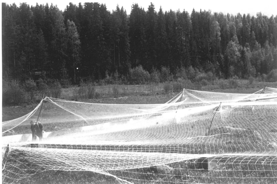
Fig. 1. One of the two 0.5-ha enclosures with net covers.

more important in areas with cyclic populations (Henttonen et al. 1987). However, local or nomadic avian predators seem to be able to affect the geographical synchrony of microtine (and shrew) cycles (Korpimäki 1986a, b, Ydenberg 1987, Korpimäki & Norrdahl 1987). The importance of the habitat in determining the total impact of predation has been pointed out by Hansson (1989) and Korpimäki & Norrdahl (1989c).