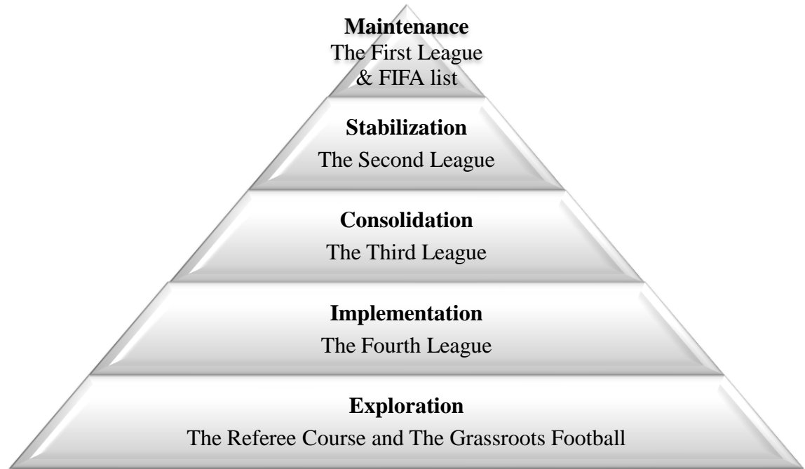
Figure 2. The career development model for Romanian football referees proposed by Andrei Antonie based on Super's career development theory (1953) and Donner and Wheeler (2001) nurses' career model.

The pyramid was used to emphasise the small number of referees that reach the top level in refereeing. Therefore, out of four thousand Romanian referees only twenty five reach the top league and just seven the international level (FIFA list).