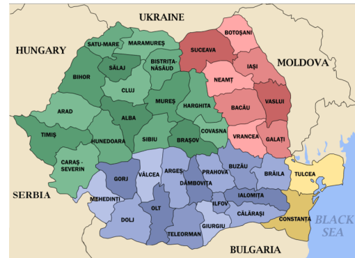
Figure 1. Map of Romania (HARTAROMANIA, 2010)

Romania (Figure 1) is one of the biggest countries in south-east Europe, not only in dimension (237,500 km 2 ) but also in population (22, 5 millions). The capital, Bucharest, - is located in the southern part of the country (inside of the Ilfov district), with a population of 2, 2 millions. (ROMANIA, 2010)