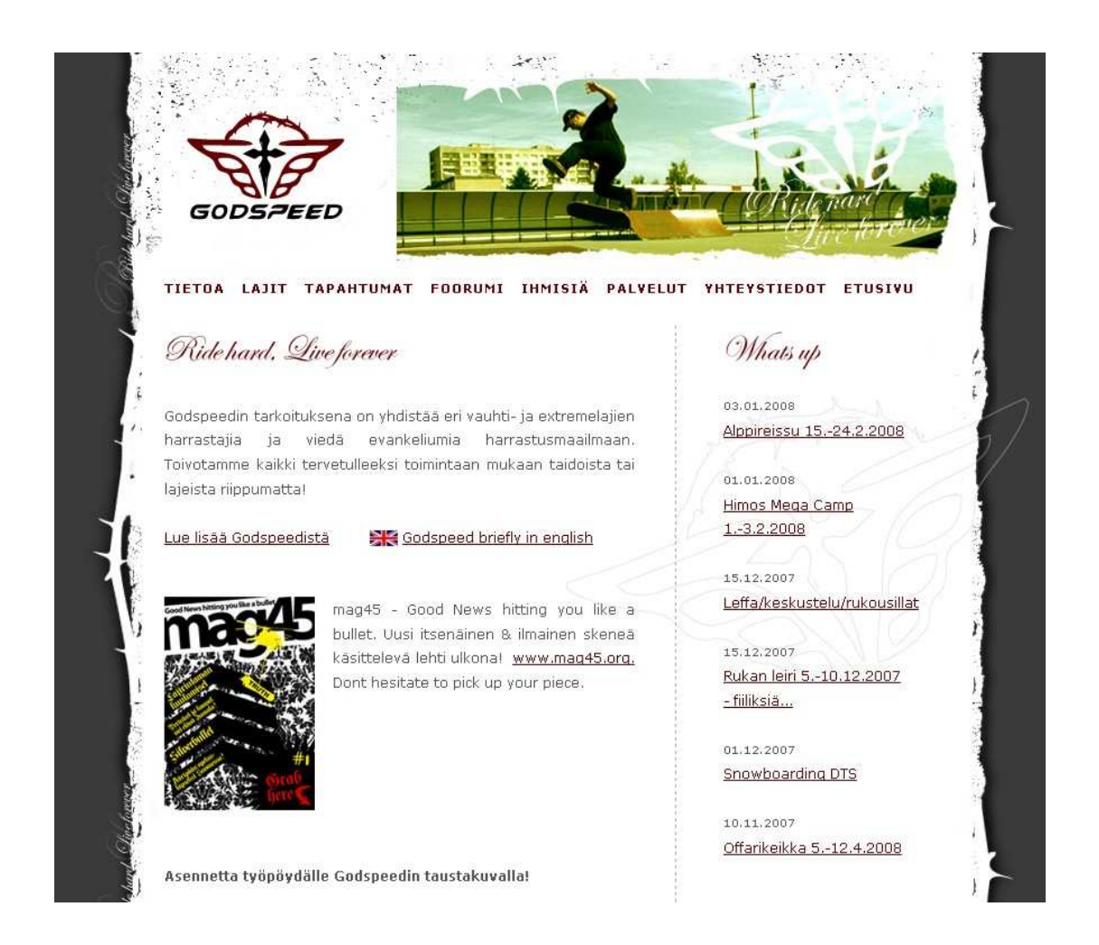
Figure 1. The front page of www.godspeed.fi

advertised on the front page under the heading 'Whats [sic] up' are regularly updated. Similarly, the banner on the right upper corner changes at regular intervals. The layout of the page therefore continually varies.