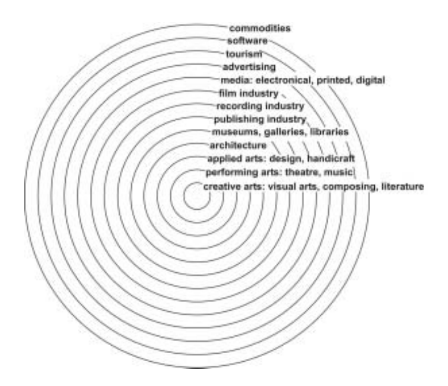
FIGURE 1 The circle model. The model presents the range of reference of the concept of the cultural industry

The problem with this model is, in my opinion, the idea that creativity lies at the core of arts and that it withers and fades when entering the outer orbits. It might also be useful to think of a 'circle' (creativity and product development activities) in each orbit. Film cutting or sound editing may contain creativity as well as scriptwriting and composing. Or, as we saw previously, commodity design and product development may be as creative as painting a canvas.