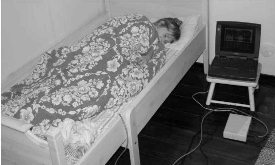
Figure 1. While being measured, the children were able to sleep in the comfort of their own bed.

according to Kaartinen et al. (1996) correlate best with the changes in standard sleep stages. Initial analyses were done with BR 99 program to report the parents of their children's sleep and then SPSS 8.0 was used to analyze data by the whole night, by thirds of a night and by hours of a night.